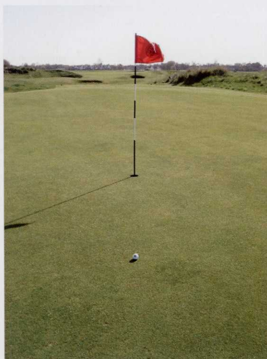
The 16th green, showing the superbly consistent surfaces produced at Littlestone