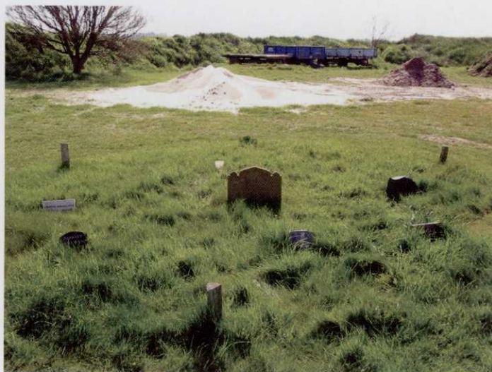
The dog's graveyard