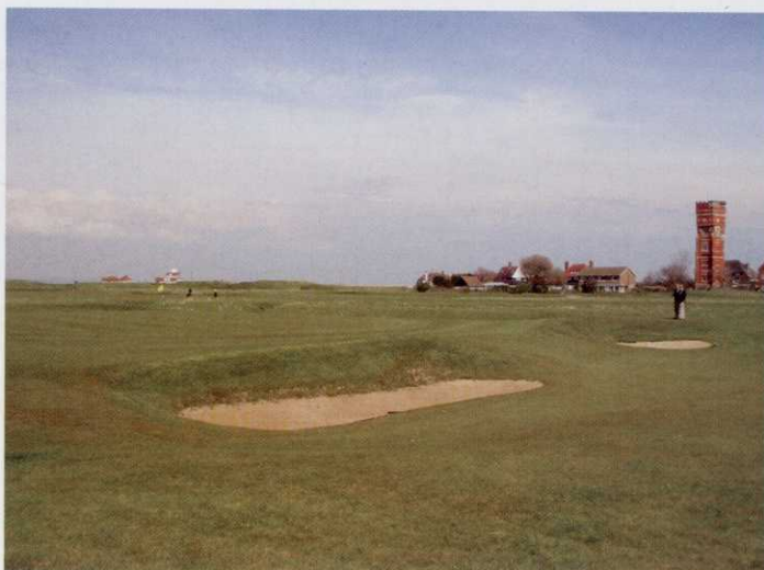
The 1st green with the water tower in the background