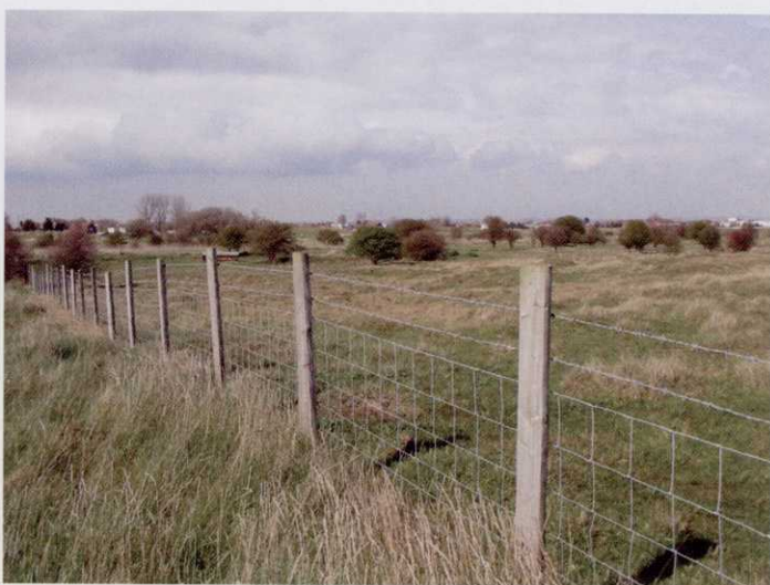
The triangle of land fenced off for sheep grazing

With the exception of parts of the 1st, 2nd and 18th, the land on which the championship course lies is a Site of Special Scientific Interest (SSSI). The site was an estuary until the Romans arrived on the shores of Britain. They drained the land and the dykes which cut across the course still serve this purpose. The course is vulnerable to flooding, as much of it lies below sea level, and the Environment Agency has overall responsibility for flood control. Between the EA and the club, the dykes are dug out as necessary to maintain their function. The club added extra drains in 2001, which stood them in good stead in November 2003 when, despite 200mm of rain, the course remained open to play.