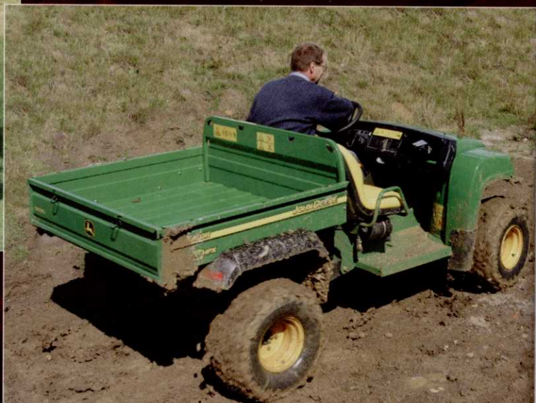
John Deere have won a large slice of the utility vehicle sector with its Gator models, but up until the introduction of the HPX models, none were aimed at tackling really tough off road conditions. Note the increased ground clearance