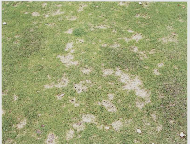
Dollar spot on bent/fescue tee

The symptoms of dollar spot are pale, bleached lesions on the leaves with a reddish-brown band usually found separating the affected tissue from the healthy green tissue. Small (dollar size) spots of bleached turf occur on close mown grass. These spots reduce the aesthetic appearance of the golf green and create an uneven surface causing non-uniform ball roll.