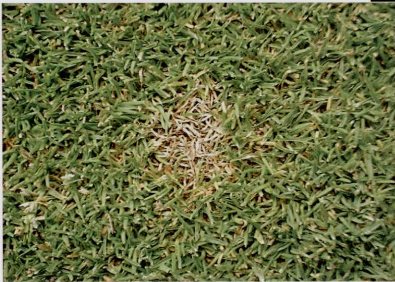
Dollar spot on an annual meadow grass green

The spots may coalesce to form large areas of affected turf. White mycelium may be present on affected areas on dewy mornings and disappears as the leaves dry. In the UK, dollar spot is most commonly found affecting Festuca spp. Factors which encourage the development and spread of dollar spot include heavy morning dews; areas of turf that do not receive morning sun or suffer from a lack of air movement due to surrounding obstructions (this allows the turf surface to remain moist for longer); daytime temperatures of 15 - 25°C; low fertility; and excessively low cutting heights.