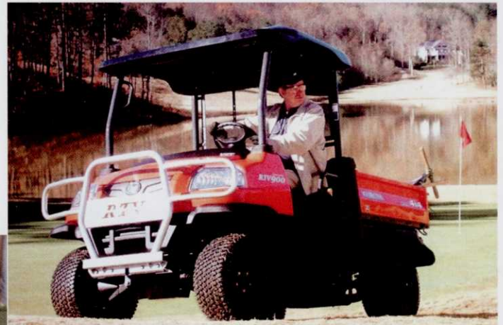
Kubota are alone in offering a sophisticated hydrostatic drive system on its recently introduced RTV900. Hydrostatics have a great deal to offer, and are well proven, the system offering the potential to potter along at a reduced engine speed. This is something a CVT automatic struggles to manage

Choosing the right machine for the job may be more complex now than it has been in the past, but stick to a few key requirements, and the number of units that fit the bill will start to shorten. There is no need, for example, to select a machine with good off road capability and 4WD for general course maintenance. Similarly, a vehicle with the capacity to carry fresh turf to the greens without risking damage at sensitive access points will call for the right combination of platform and tyre choice. Set the demands and the machine will more likely or not choose itself.