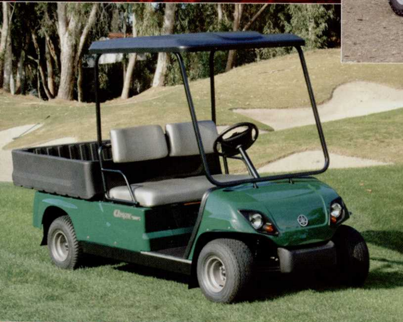
Yamaha caters for a wide range of users with its choice of Rhino and U-Max models. The U-Max comes with a choice of petrol or electric power, the powerful Rhino, pictured, offering sprightly performance.