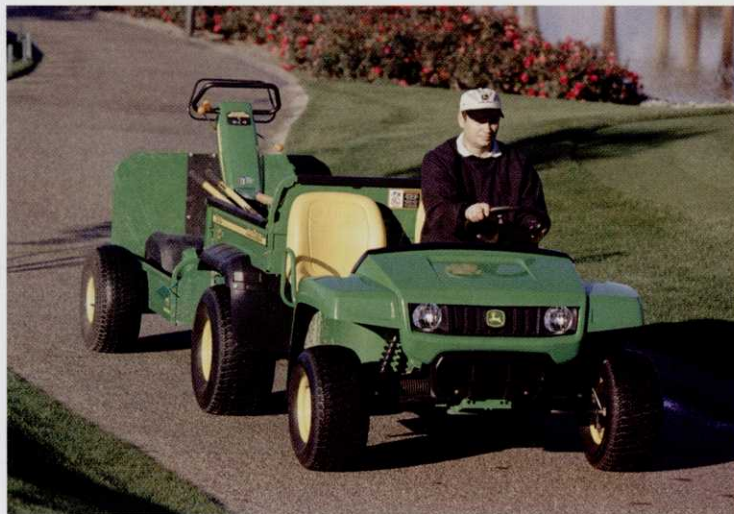
Latest Deere 'T' series Gators benefit from more power and better brakes; fuller details unavailable at the time of going to press. Note the use of a low loading trailer. This makes it far easier to load and transport heavy items of kit such as pedestrian greens mowers

Yamaha compete at both ends of the utility vehicle scale with its £7,599 petrol powered Rhino 660 and £5,000 G23 U-Max. The former is a head to head competitor with a vehicle like the Kawasaki Mule 600, but with considerably more power. The U-Max, which is also offered with electric power, is based around the Yamaha Golfcar and powered by a 357cc 11.4hp engine. It is classed as a light utility, but its roto moulded cargo box has a decent 363kg capacity with hydraulic assisted tilt available.