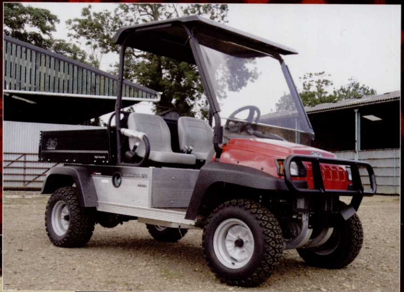
Club Car has introduced its Carryall 294 as a direct competitor to the diesel Mule 3100. Fitted with 'IntelliTrak' 4WD engagement and limited slip differentials front and rear, it will access difficult to reach areas. Perspex screen and roof offer useful protection, full cabs coming as an option

At this point, mention should be made of mains charged electric vehicles. These are not covered specifically within this article, but some models, such as variants of the Yamaha U-Max, Club Car, Toro Workman and Deere Gator are offered with battery power. It is easy to get tripped up when looking into this form of motive power, but courses that want to make this energy source work will find it offers a number of advantages. It is not necessarily cheaper, but electric, and hybrid electric power, is the future. It is well worth giving an electric utility a try over a few days in winter. Cold weather will tend to shorten the vehicles range per charge, so giving a good idea of what can be expected in terms of range.