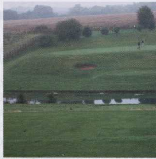
16 Changing the system at Chipping Norton

Your next issue of Greenkeeper International will be with you by December 7 2005