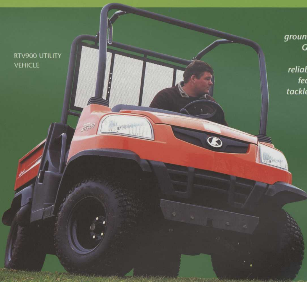
RTV900 UTILITY VEHICLE

When it comes to professional groundcare you can't beat the Kubota Grand-L30, ZD28 and RTV Series. Powered by 30 years experience, reliable and loaded with versatile pro features, they are tough enough to tackle your most demanding jobs. For the perfect finish drive with the professional team.