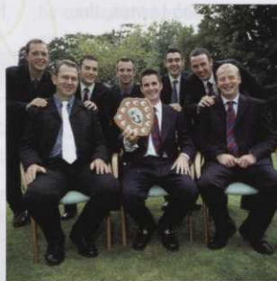
21 Another close final at BIGGA HOUSE