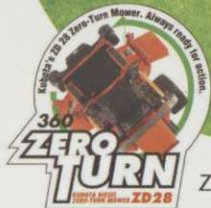
ZD28 DIESEL ZERO-TURN MOWER