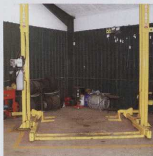
24 Investing in your workshop