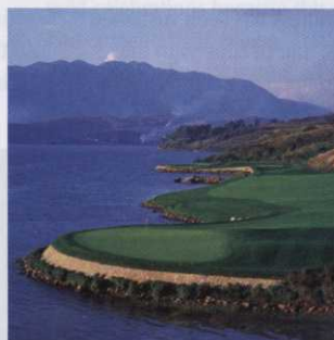
32 Life as a modern day architect