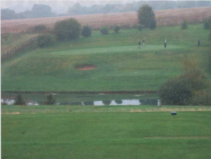
The 3rd hole at Chipping Norton