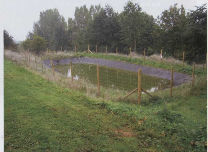
The 'lagoon' will provide a crucial water supply in the summer