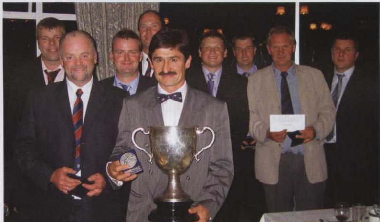
Above: The victorious Midland Region