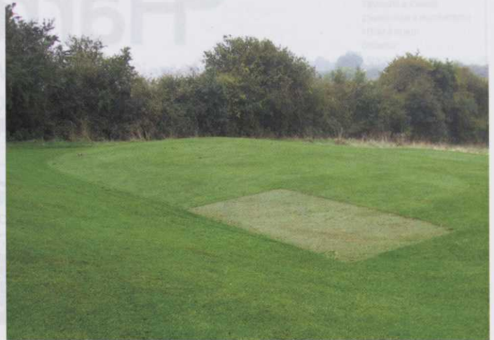
Artificial winter mats have been inserted within the actual tee