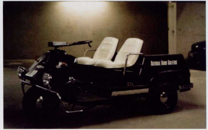
A crossgolf buggy, slightly different to what you would see on a traditional course

"We never realised when we started organising these big events just how many problems we would face. In Germany it is no problem to gain permission to hold an event in a city. However in other countries we have had some