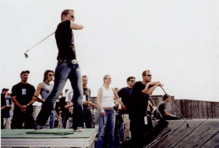
No dress code is required in the game