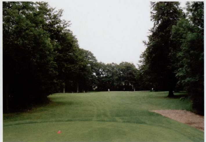
▲ Left and right: The contrasting environment to Falster greens - exposed and shaded ▲