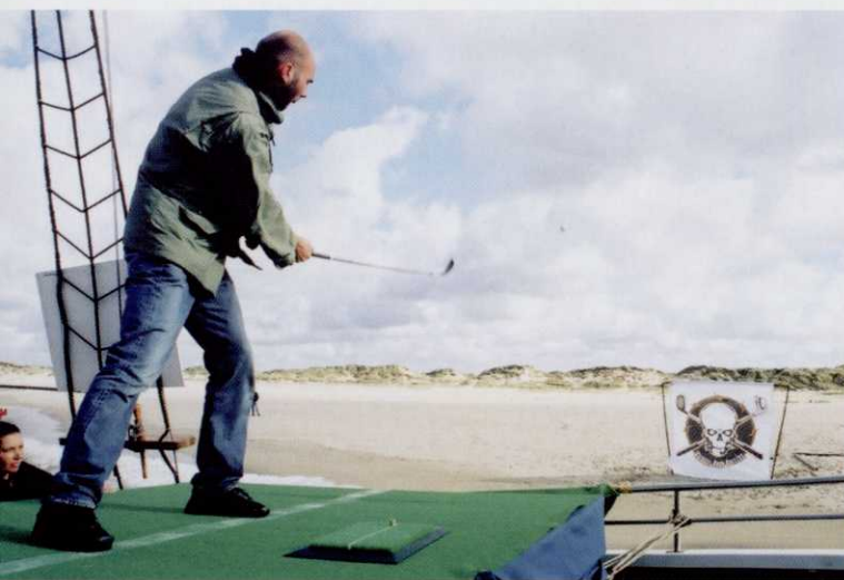
There is only one rule in crossgolf - safety first!

As Scotland is the home of traditional golf, Germany is the fatherland of crossgolf and the biggest tournament in the sport has just been held in the country. In a six city tour, crossgolfers fought it out for the much coveted NBG Iron Cup, the holy grail of the sport. Hamburg, Cologne, Frankfurt, Munich, Leipzig and Berlin hosted the third annual tournament, which allowed 60