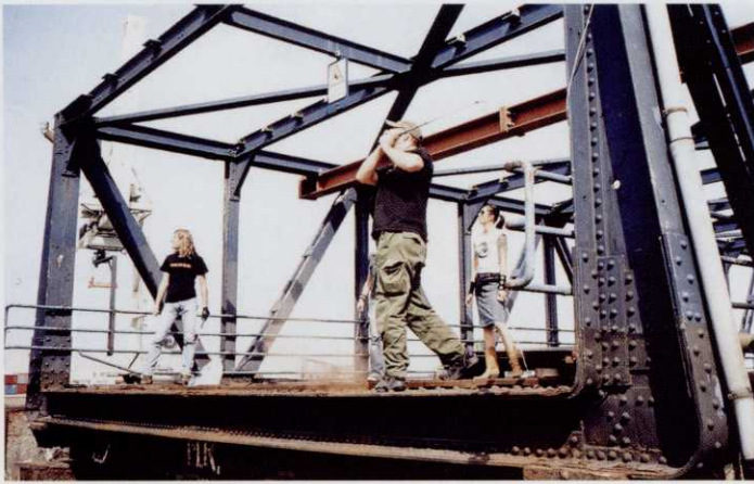
Imagine this tee shot at your club!

pro Alex Cejka is due to one underlining factor, the lack of public courses in the country. While the game becomes more accessible in numerous nations across the globe, in Germany golf remains an elite and expensive pastime. To play golf participants, firstly, must be licensed and then the cost of membership to a private golf club normally prices the majority of wannabe golfers out of the sport before they can even think of swinging a nine iron in anger.