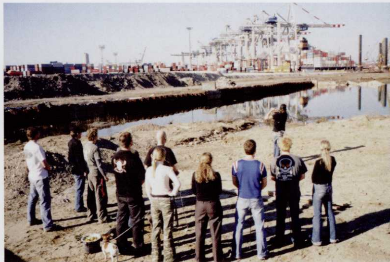
Vast areas such as construction yards make a great crossgolf course