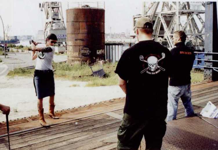
There is no debate about women playing against men in this extreme version of golf