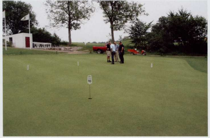
▲ Left and right: The practice green at Furesø in May and August ▲