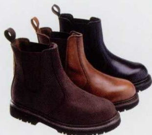
CODE SSDB LEATHER DEALER BOOT