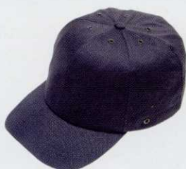
CODE SBC SAFETY BASEBALL CAP

Also available with towelling headband and terylene harness. CODE C1125 £6.25