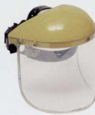
CODE FV7 HEADBAND & BROWGUARD

Complete with 7" polycarbonate visor. Complies to EN166. Mesh visors available separately.