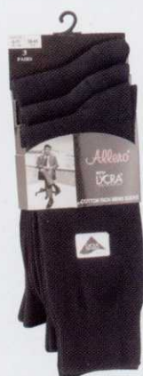
CODE FIRE1 COTTON LYCRA SOCKS Really cool and comfortable for summer. Ideal uniform sock used by most major Fire Brigades FIRE 1 Sizes 6 ~ 11 FIRE 2 Sizes 4 ~ 7 Fire 3 Sizes 11 ~ 14 Sold in packs of three. £3.00 (Per pack)