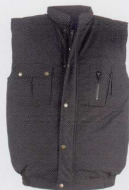
CODE HBW POLY/COTTON BODYWARMER With quilted lining and a multitude of pockets. Navy, Black or Green. £8.00 Sizes S ~ XXL