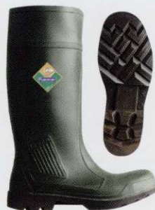
CODE PSW PUROFORT SAFETY WELLINGTON

£40.00 Fur lined £35.00 Unlined (zero VAT)