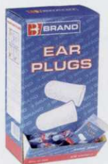
CODE BBEP FOAM EARPLUGS