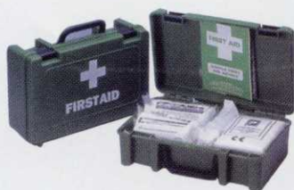
CODE FAK10 FIRST AID KIT

For up to 10 people. Contains sufficient equipment for a small workshop or office.