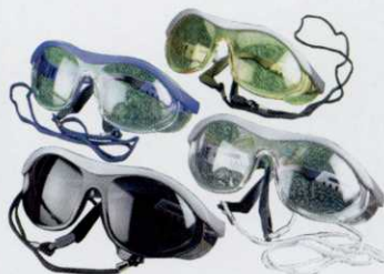
CODE BBUTS ANTI FOG SUPER TOUGH NYLON LENS GLASSES

Complete with unique neck clip and cord. Side shields. 99.9% UV protection. Clear, yellow or shaded lens.