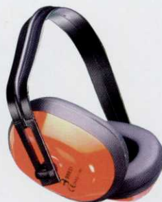
CODE BBED BUDGET EAR DEFENDER

Complies to EN352-1. Weighs only 167g One size fits all.