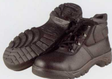
CODE CDDC DUAL DENSITY CHUKKA BOOT

Lightweight with low profile sole, this boot is ideal for work on or around the greens.