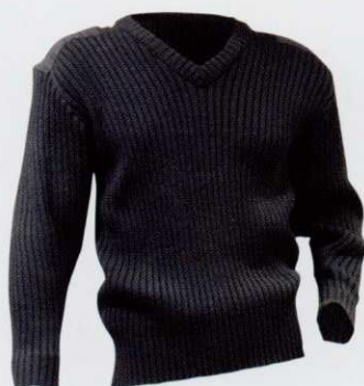
CODE AMOD ACRYLIC MILITARY STYLE SWEATER Black or Navy £6.95 Also available in all wool. CODE WMOD £17.95 Sizes S ~ XXL