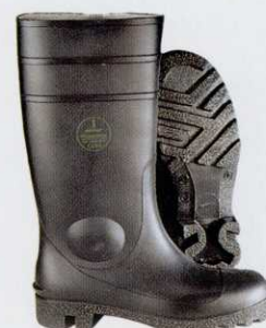
CODE BBSBL BUDGET PVC SAFETY WELLINGTON

Also available non-safety CODE PNSW £21.45