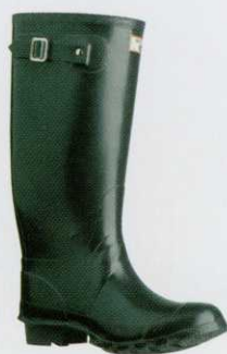
CODE HOW HUNTER ORIGINAL WELLINGTON

Also available non-safety CODE BBG £5.00