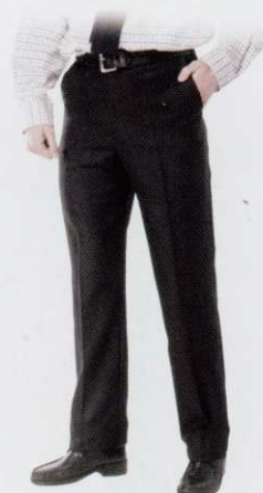
CODE PVTT POLY/VISCOSE TAILORED TROUSER Suitable for work or casual wear at a sensible price. Black, Navy or Grey. Sizes 30" ~ 46" in Regular or Tall fitting. £7.95 Also available Poly/Wool CODE PWTT £15.95