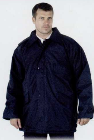
CODE PWSJ WATERPROOF SECURITY JACKET Black or Navy. Sizes S ~ XXL £14.75 Trousers to suit above CODE PWST £4.15