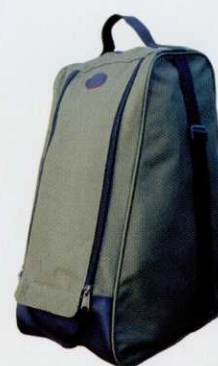
CODE WBB WELLY BOOT BAG

Also available as chest wader CODE PCW £26.00