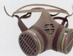
CODE MUFM TWIN FILTER RESPIRATOR

Capable of handling most chemicals and pesticides. Please check with spray manufacturers recommendation. If in any doubt, please call us.