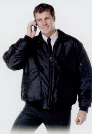
CODE SEBJ SECURITY BOMBER JACKET Black or Navy. £12.95 Also available in Hi Vis CODE HVBJ £16.50 Sizes S ~ XXL