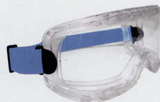
CODE GAM ANTI-MIST WIDE VISION GOGGLE