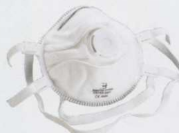
CODE BBP3 VALVED PARTICULATE RESPIRATOR

Complies to EN143-FFP3. Disposable mask capable of handling most types of spraying. Please check with spray manufacturers recommendation. If in any doubt, please call us.