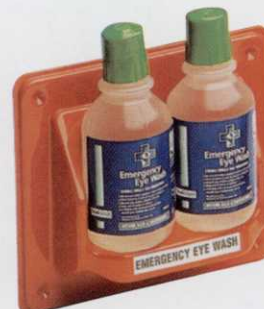
CODE EW2 EYEWASH STATION

Holding two 500ml bottles of sterile saline eyewash.