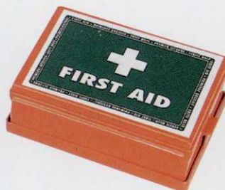
CODE VFAK VEHICLE FIRST AID

Supplied with bracket to attach to vehicle. Essential when staff may be long distances from base.