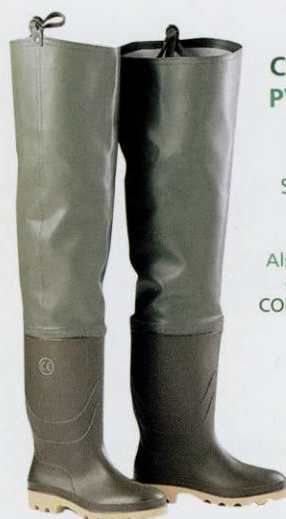
CODE PTW PVC THIGH WADER

Also available as slightly cosmetically imperfect but guaranteed to be functional. CODE HOBW £27.66