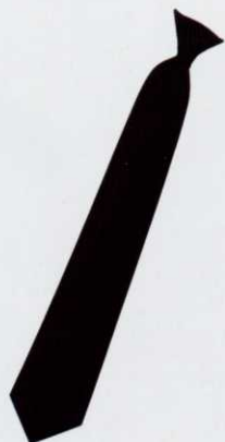
CODE COTN CLIP ON TIE Black or Navy. £2.95