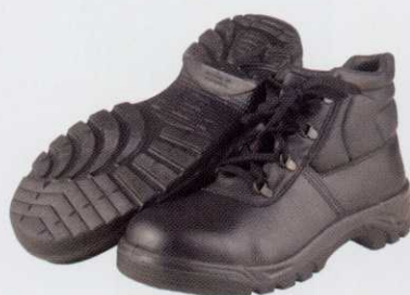
CODE CDDC BUDGET SAFETY CHUKKA BOOT Lightweight with low profile sole, this boot is ideal for security work. Sizes 4 ~ 13 £13.50 (zero VAT)