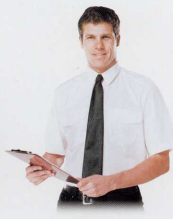
CODE PS POLY/COTTON PILOT SHIRT Two pockets with button down flap. Epaulettes on shoulders. Blue or White. Sizes 14 1/2" ~ 18 1/2" Short Sleeve £4.95 Long Sleeve £5.50