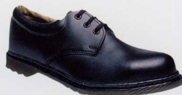
CODE NSS NON-SAFETY SECURITY SHOE Sizes 5 ~ 12 £21.65

FRS also offer a range of Security Caps, Epaulettes and other accessories. Please see the website for more details. A full printing and embroidery service is available, please contact us for prices or visit www.bestinthecountry.co.uk/embroidery.php