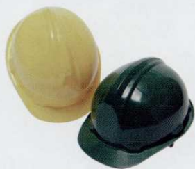
CODE HH ECONOMY SAFETY HELMET Complies to EN397 with adjustable size.