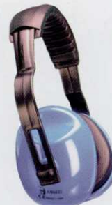
CODE BBSED DELUXE EAR DEFENDER

Complies to EN352-1. Padded headband for extra comfort. One size fits all.