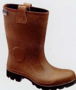
CODE DRB DUNLOP RIG-AIR BOOT

35% Lighter than a leather rigger boot, excellent insulation properties and 100% waterproof. Anti-clog sole profile.