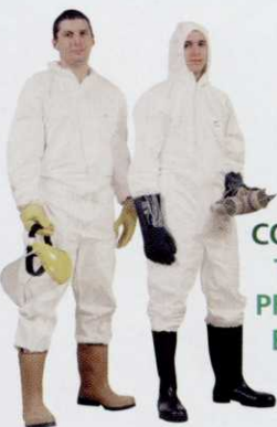
CODE TBS TYVEK PROTECH BOILER SUIT

Spare ABEK filters £6.50 Spare dust filters £3.60