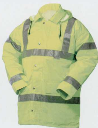
CODE SEJENG HI VIS SECURITY WATERPROOF JACKET Black £18.25 Saturn Yellow or Orange £14.50 Sizes S ~ XXL