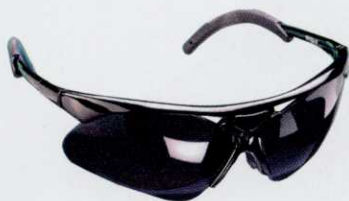
CODE BBMS SPECIALLY COATED SUNGLASSES

With unbreakable polycarbonate lens. To EN1836. Smoked lens protects from UV rays. Modern style.