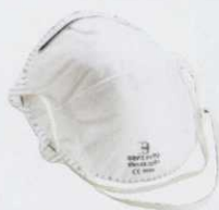
CODE DFM DISPOSABLE DUST/MIST RESPIRATOR

Complying to EN149 P2. Suitable for use with most types of spraying. Please check with spray manufacturers recommendation. If in any doubt, please call us.