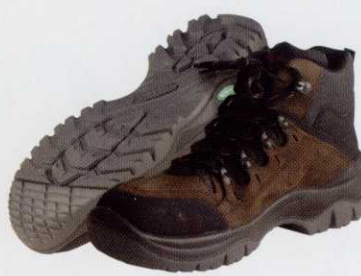
CODE TST TRAXION SAFETY TRAINER