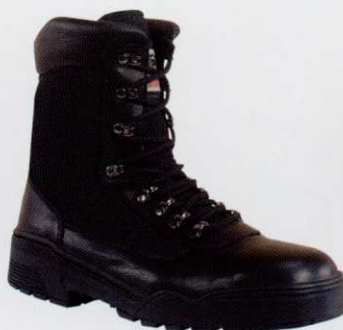
CODE POB PUBLIC ORDER SAFETY BOOT Sizes 5 ~ 12 £34.95 (zero VAT)