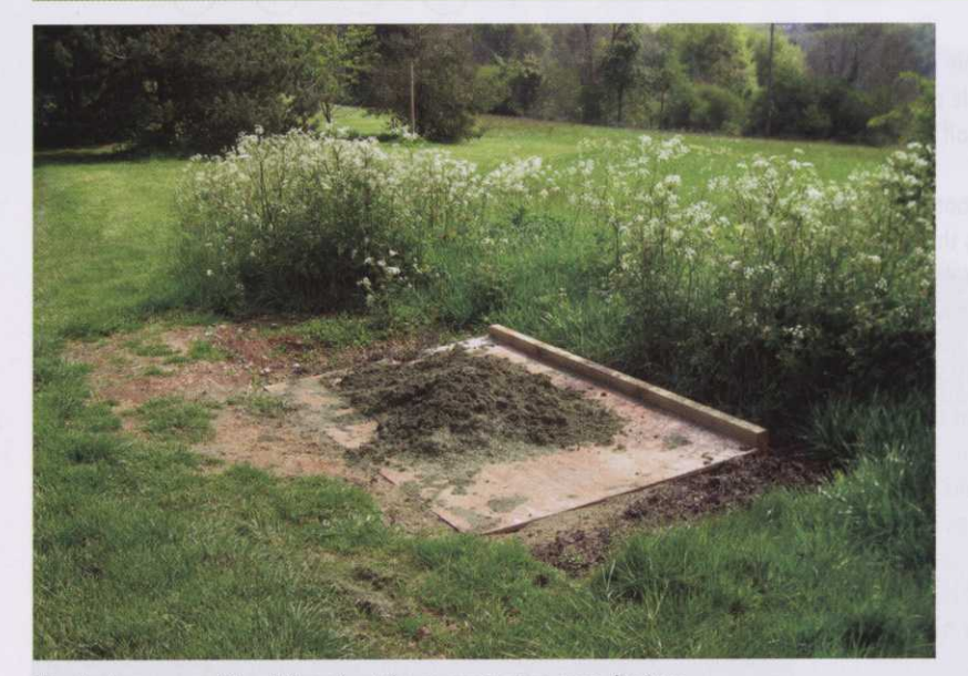
Wooden trays are positioned throughout the courses to store grass clippings