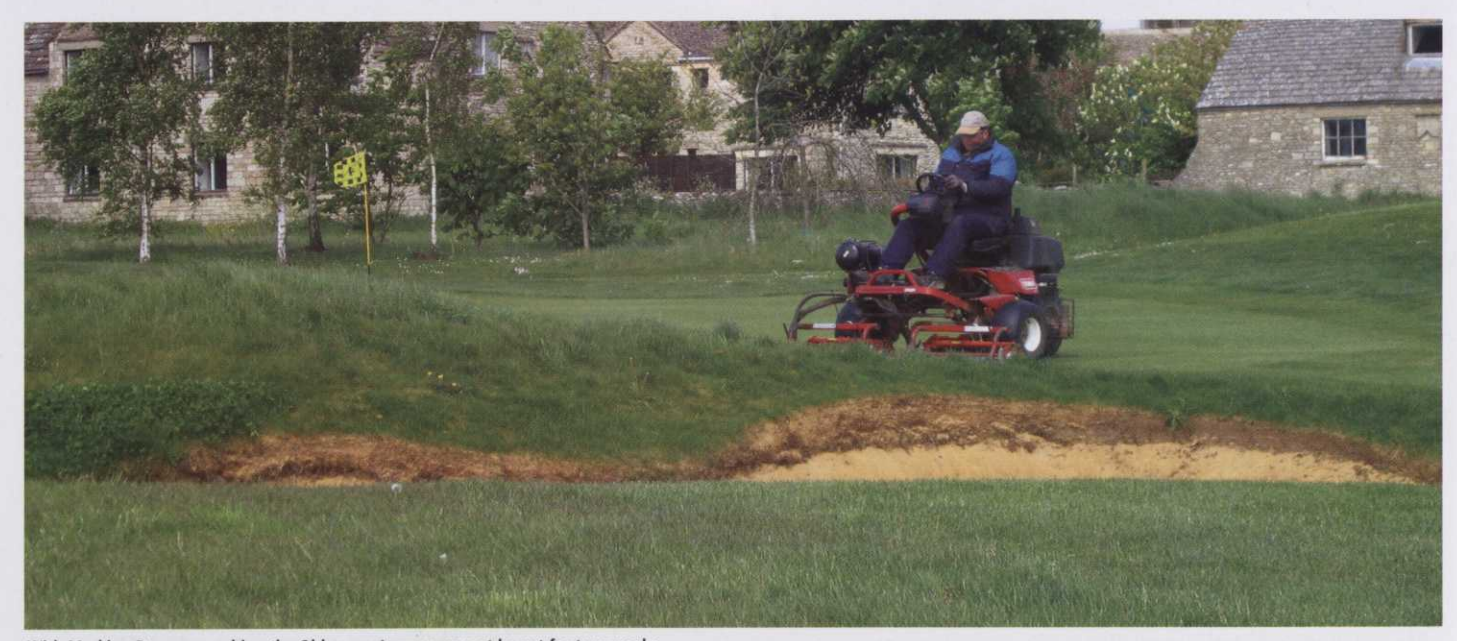
With Marking Day approaching the Old course's grass cannot be cut for two weeks

"A fan is used twice a day to get some oxygen into it to aid decomposition and we reuse what we produce in about nine months."