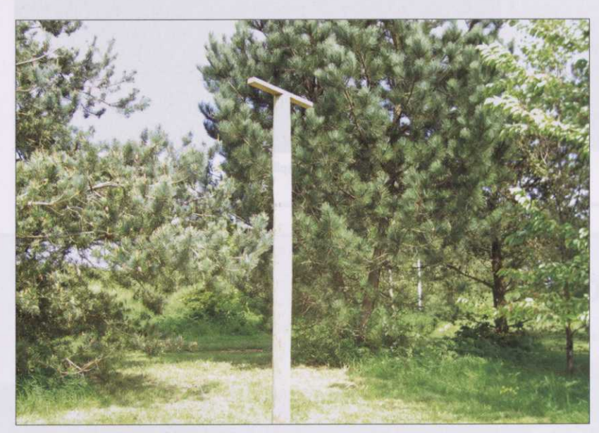
A place to rest for the local buzzards

"If you get the right professional advice it carries the day. That's what we do. If we feel we haven't got the knowledge, we'll go out and get it rather than making it up as we go along".