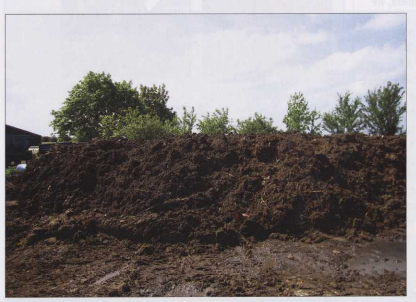
The compost heap has a fan which blows air into it everyday to assist decomposition