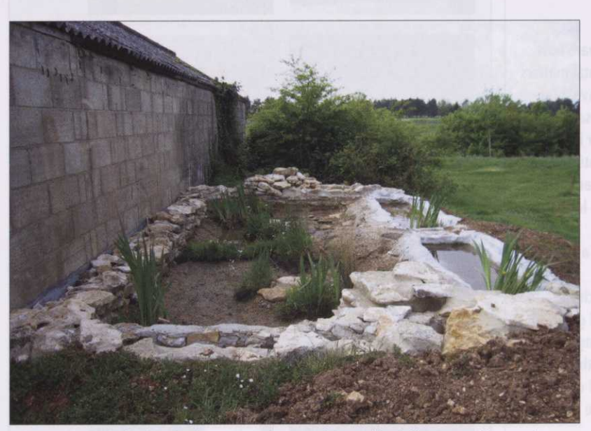
A feature like this highlights why the BIGGA Environmental Competition judges were so impressed