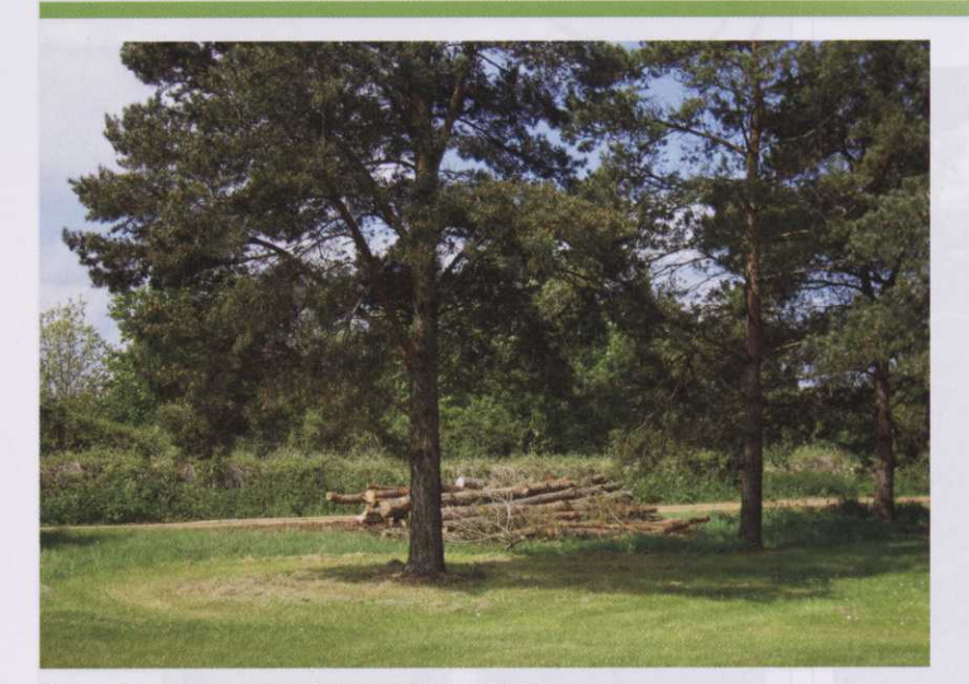
The club have been busy transplanting and thinning out trees