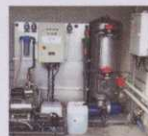
The ENZYMATIC15 wash water recycler. Designed & built in the UK by ByWater