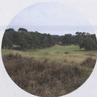
12 Course Feature - Parkstone Golf Club.