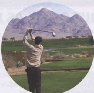
28 John Deere Team Championship.