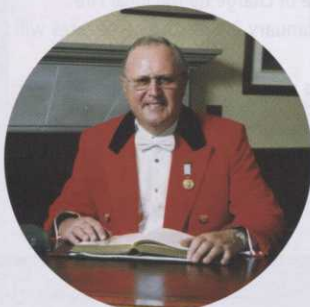
17 An Extraordinary Life in Golf.