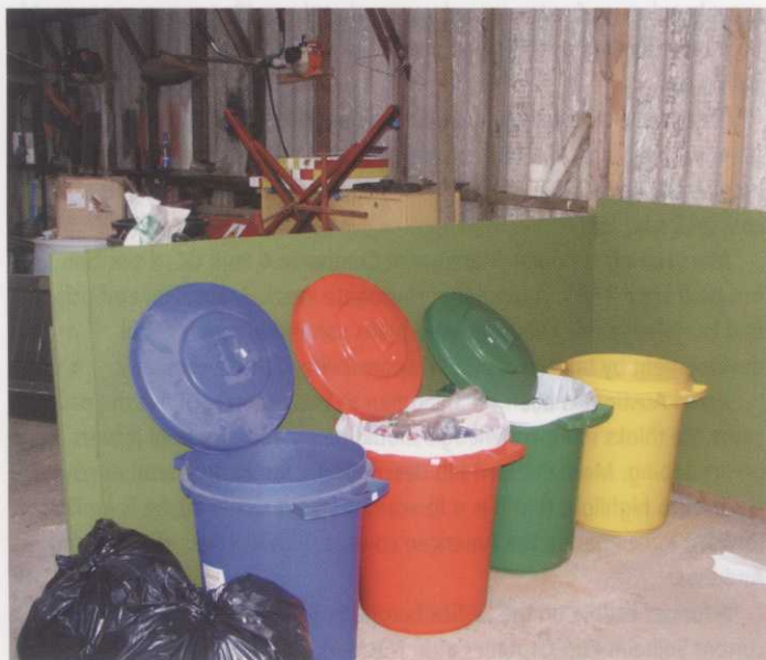
Colour coded recycling bins at Machrihanish Golf Club, one of the Scottish Clubs to receive 'Highly Commended' status in 2005

Brighthouse Bay Golf Club is a great example of a small club which has good credentials and commitment. Through entering the BIGGA environment competition for the last three years its work has been recognised and it has won two prestigious awards and £1000 prize money.