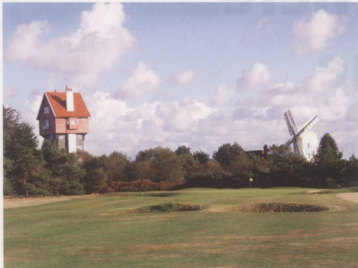
Thorpeness' extensive environmental programme earned the club the overall winner award