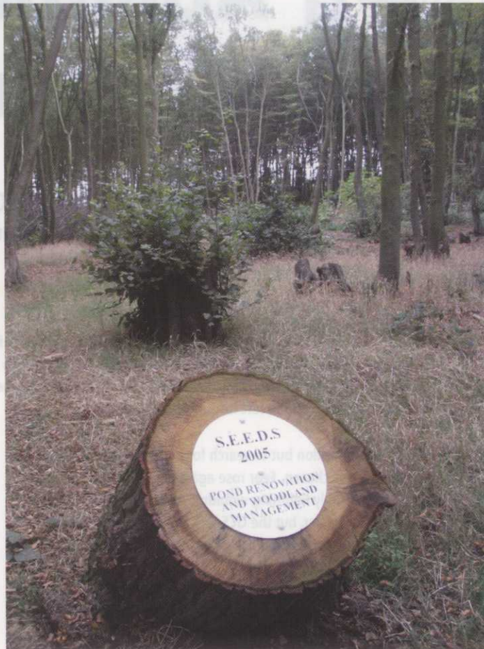
Ecological information sign erected by green staff at South Essex Golf Club

If your club deserves recognition for carrying out similar work, then don't be put off entering by the final myth about the competition which is that the entry form is a hassle to get hold of and is too long and laborious to fill in.