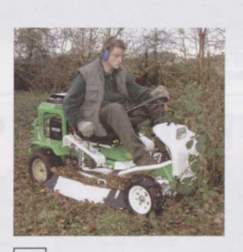
19 How to tackle difficult areas on the ground