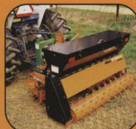
STR Super turf Renovator/Grass Seeder and all landscaping equipment.

Woods (also Gill and Gannon) tractor mounted mowers & landscaping equipment. Agrator Rotavators, Powered Tillage Equipment & heavy duty Flail Mowers/ Shredders