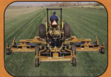
Turf Batwing Finishing Mower 12-17ft.

Dealers required throughout the UK for this superb range of top quality tractor mounted equipment