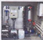
The ENZYMATIC15 wash water recycler. Designed & built in the UK by ByWater

Tel: 01530 563388 Fax: 01530 563399 Email: sales@bywaterservices.co.uk Web: www.bywaterservices.co.uk