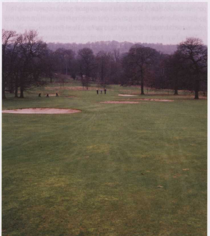
▲ The new bunkers have improved the definition of the course

"It is a very conscious club, spending money wisely and it is full of very professional people whose contribution to my well being since I arrived has been fantastic. They appreciate what I've done and I appreciate being around them."