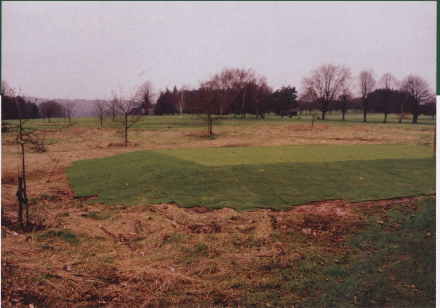
▲ A new tee built over the winter