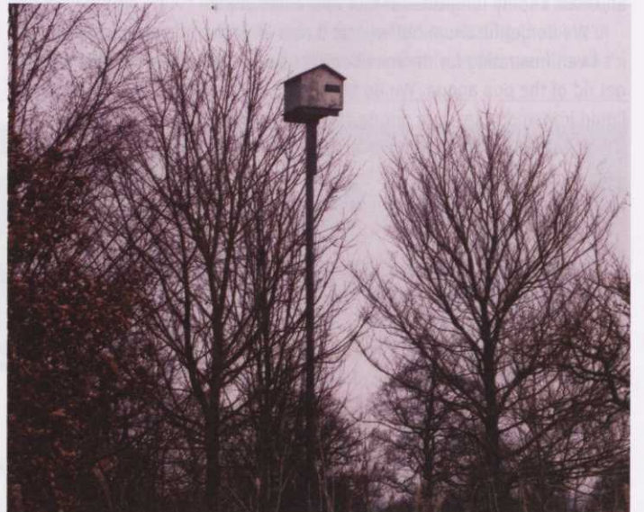
▲ This owl box gives a superb view for any residents