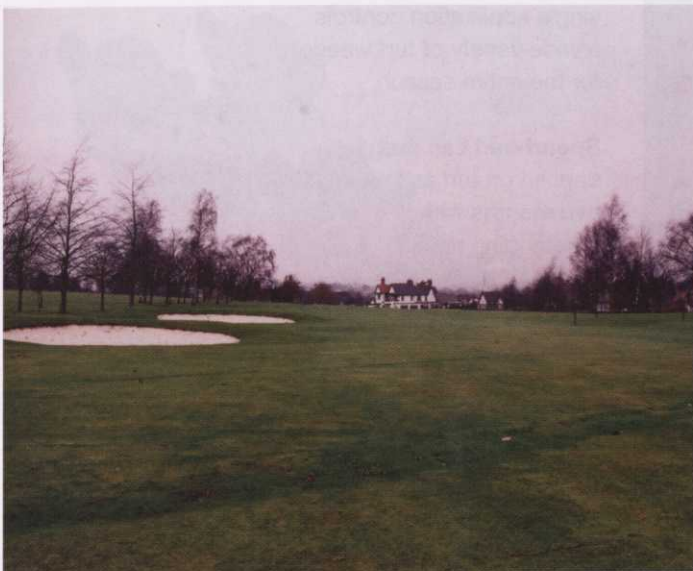
▲ The view down the 18th with the clubhouse in the distance

"I love nature and we've been pro-active in erecting bat and barn owl boxes, while we ensure when we fell trees we don't burn the wood but stock pile it to provide homes for mice, voles and invertebrates.," said Phil,