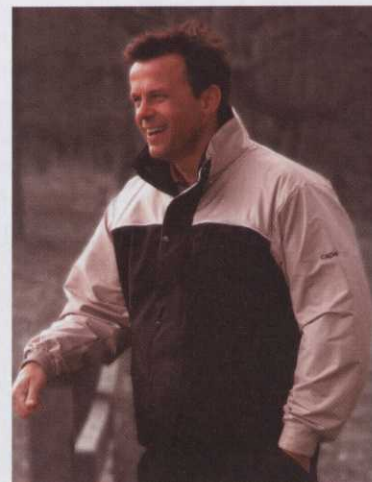
▲ "Sport" jacket