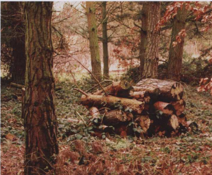
▲ Logs are piled to provide habitat for wildlife