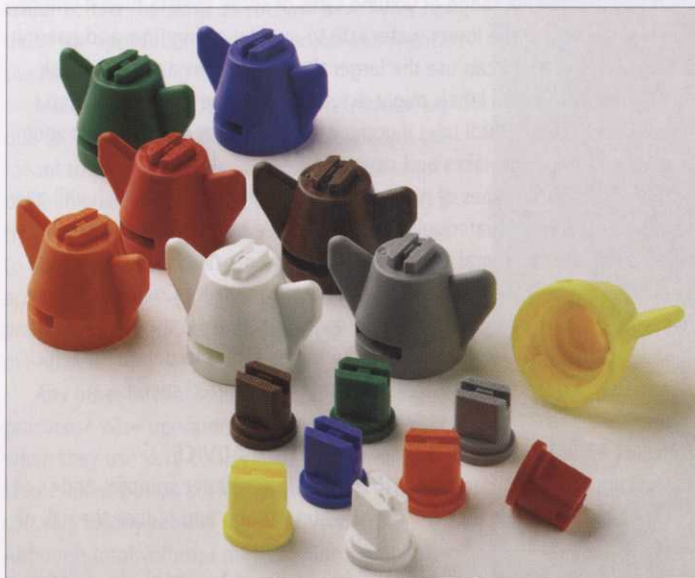
▲ Hardi standard flat fan nozzles are colour coded to quickly identify water volume rates and sprayer quality, from fine to very coarse

The design of the nozzle influences the spray quality produced using terms that reflect their mean drop size: Fine, Medium, Coarse or Very Coarse. As a rough rule of thumb, Fine and Medium sprays are well retained by plant surfaces while Coarse and Very Coarse can be ideal for soil applications.