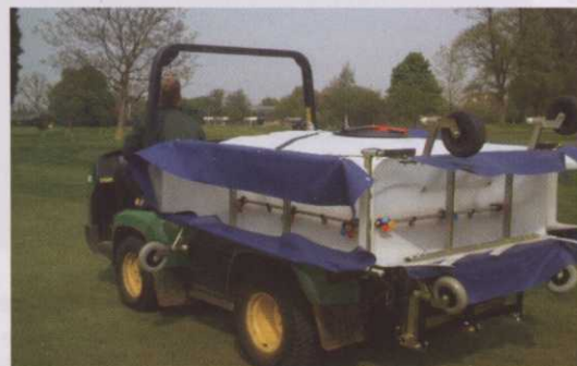
▲ JD600 with 4.5m Hurricane neatly stowed around the tank for transit

workshop that actually make a contribution to overheads!