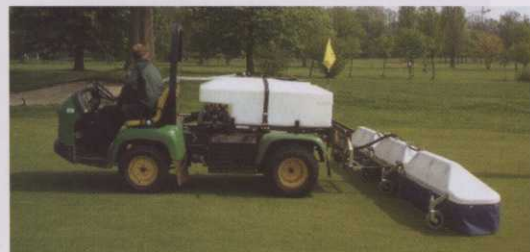
▲ JD series 600 ltr sprayer and 4.5m Hurricane on a ProGator at Roehampton

light Hurricane trailed and Tornado suspended booms, which offer manual or electric wing fold options, plus manual or power tilt boom stow options (standard open booms are also available). With shielded booms, any nozzle can be used with confidence, tank mixes spray up to three times the area, tripling productivity and on-target accuracy brings reductions in pesticide application of up to 20%, making these latest State of the Art sprayers perhaps the only machinery in the