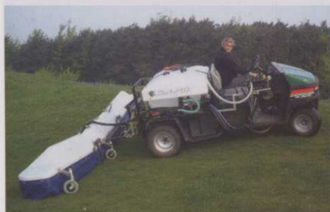
▲ RJ series 600 ltr sprayer and 4.5m Hurricane on a Cushman at Pedham Place, Kent

All services are now totally enclosed within the tank envelope. A new compact plumbing module, together with the triple diaphragm pump and a clean, direct coupled, hydraulic drive are located on removable trays, while hoses have been reduced to a minimum, one only 12cm long!