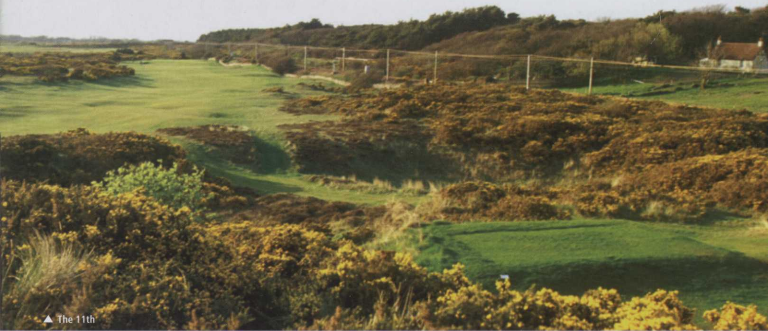
▲ The 11th

"She said to me 'There's 40,000 people walking past our house and you left the door open!'," he said smiling ruefully at the memory. The chances of him making the same mistake again must be slim.