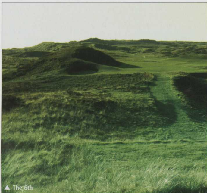
▲ The 6th