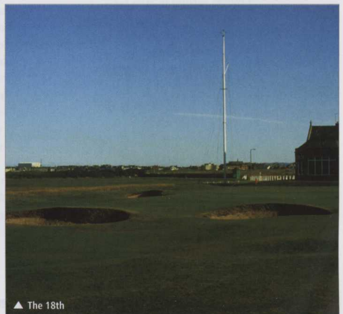
▲ The 18th