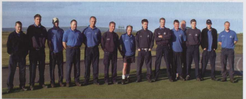
▲ Royal Troon Greenkeeping Team