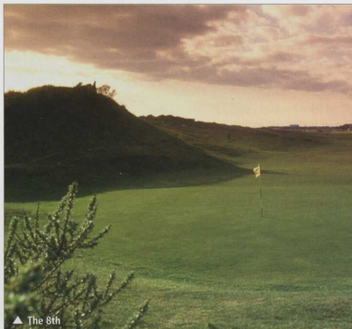
▲ The 8th