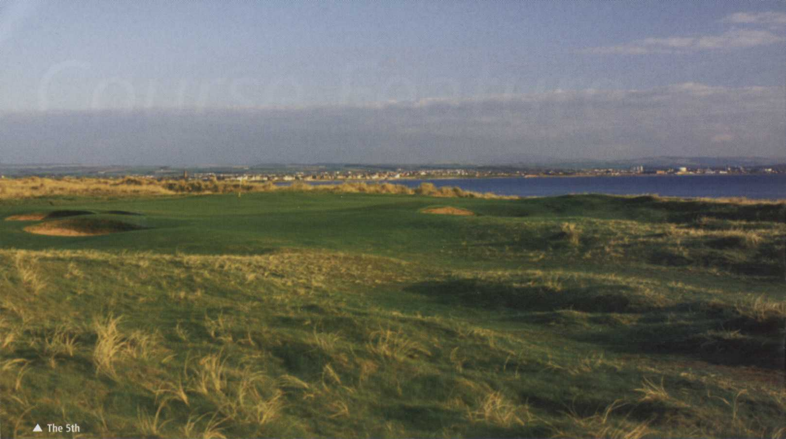
▲ The 5th

Indeed the course won't have too many dramatic changes from the '97 Open other than a few new tees and revamped bunkers.