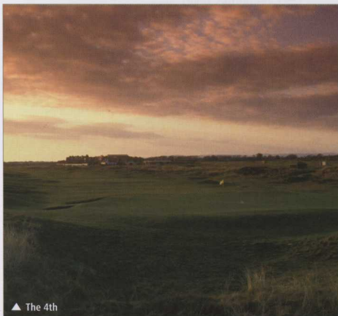
▲ The 4th