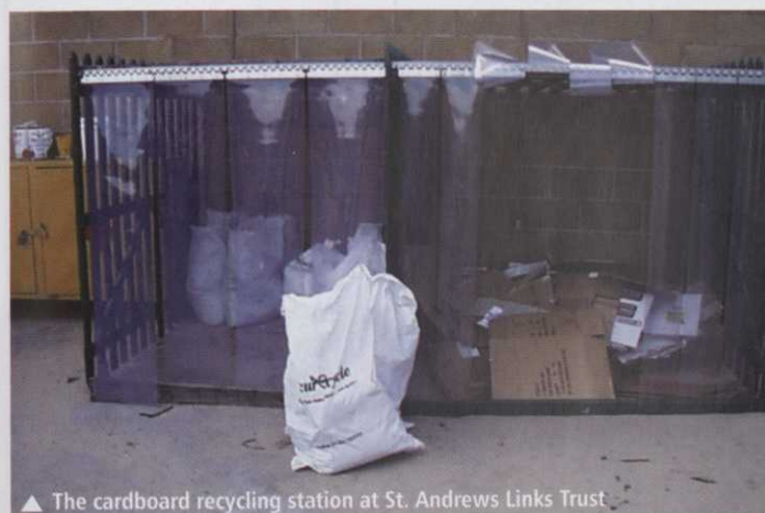
▲ The cardboard recycling station at St. Andrews Links Trust

Grass clippings from greens tees and aprons are collected at all times, while those produced from fairway cutting are collected 80% of the time. These clippings are stored briefly on the course before being transported to central storage sites. There they are mixed with other organic materials and composted, to be used again as divot mix, top dressing or construction material.