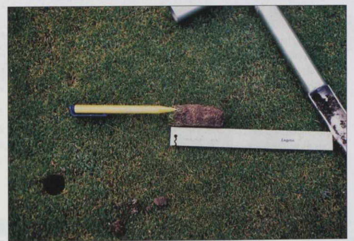
A core sample from the year 2000 with 5-6cm of chatch and little rootzone

Now we all know what a difficult start to the season we had last year. We also had a severe winter –18 degrees interspersed with mild periods and some snow cover that resulted in on some greens 50% of the poa being hit by fusarium brought on by the huge swings in temperature. As we have no fungicide we took a different view on this damage to the greens than you might take in the UK. For us this was a really positive situation to be in. We had lost 50% of our problem in one go. The poa was hit and we sowed 500kg of BAR 2 seed in March and April into the greens. The cold spring held the poa back but the new seed still germinated then we waited as the scars started to fill in, not with poa but fescue. It would have been so easy to reach for the fertiliser spreader and hit the irrigation switch to on and hey presto no more scars and a nice crop of poa.