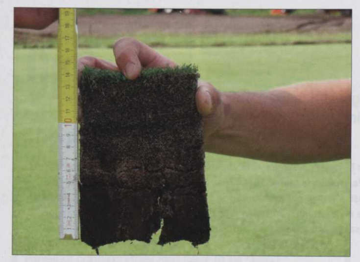
A measure of improvement

I have 1100 members who like some of yours were not over impressed by their playing surface this spring but by communicating they understood what our aims for the greens were and that we were looking to the long term not a quick fix. (If you want a member to read a report leave a few copies in the bar area as well as on the information board). We could never have achieved so much without the understanding and support of the membership. If you do not communicate you would probably never get past your first season doing a renovation of your greens on the scale that we have done.