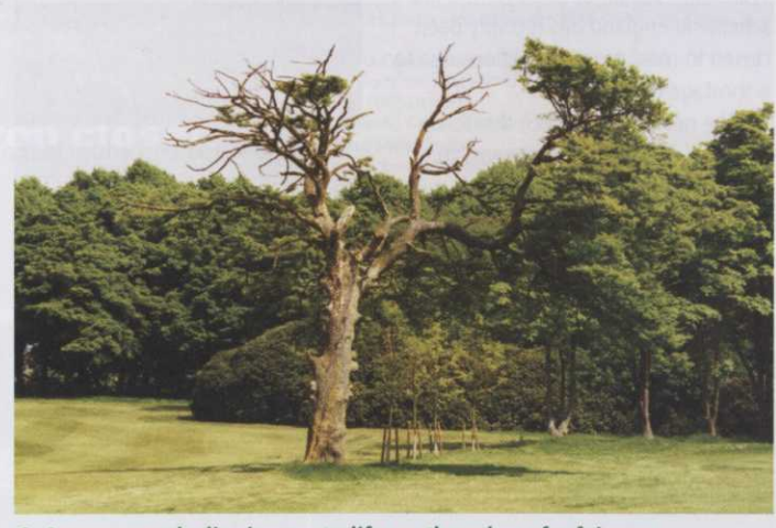
6. A mature oak clinging on to life on the edge of a fairway.