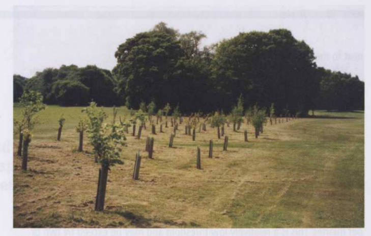
3. Extending an existing wood into 'dead' ground to separate holes.

The other major consideration is who or what is the tree a danger to? An old rotten beech tree in the middle of a wood is completely different to one