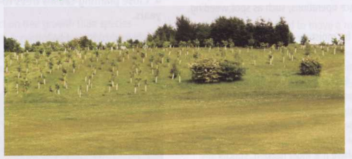
8. Tree planting done with grant aid at Ashton-in-Makerfield golf course.