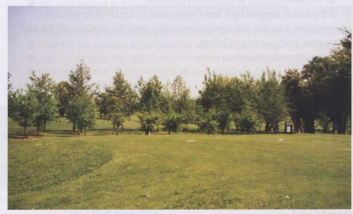
4. Close planting causes trees to begin to close the canopy after five years.