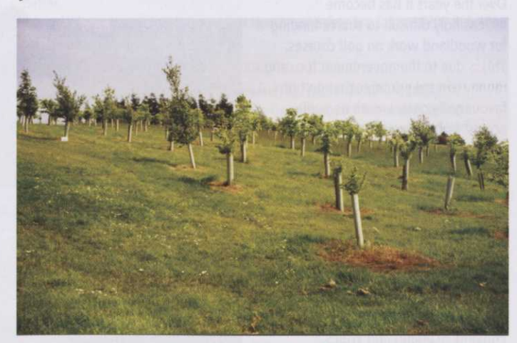
5. Inter-tree mowing focused on the edge of the tree planting block.