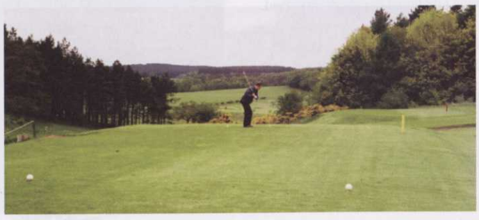
9. Graded woodland edge on the right and commercial plantation on the left.