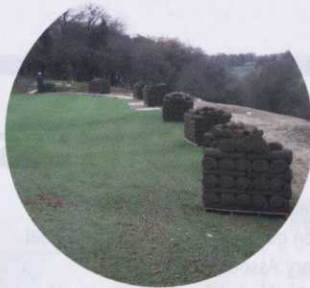
12 Course Feature - Henley Golf Club.

© 2004 British and International Golf Greenkeepers Association