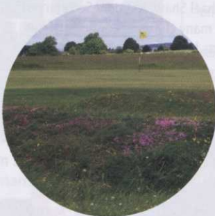
16 2004 BIGGA Golf Environment Competition.