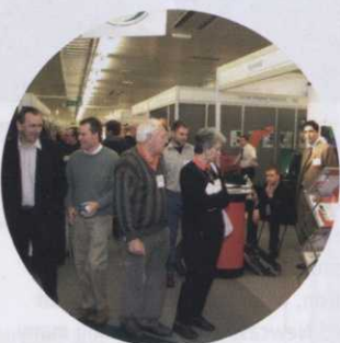
23 2005 Harrogate Preview.