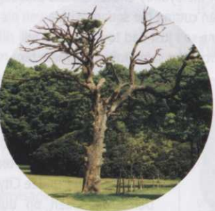
50 What wood you do?