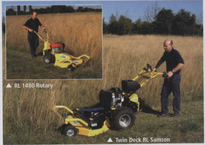
▲ RL 1480 Rotary

For more information telephone 01462-683031.