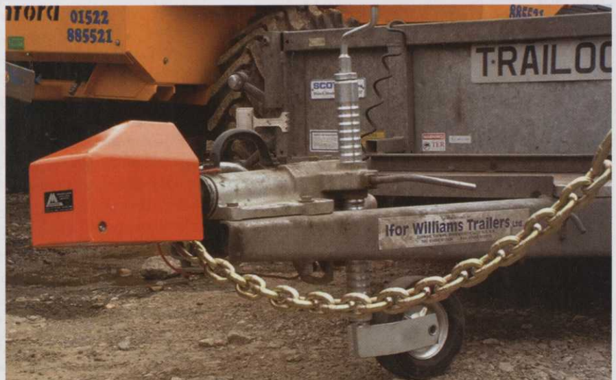
▲ HD Hitchlok and HD Security Chain

To contact Security Companies see Security in the Buyers' Guide.