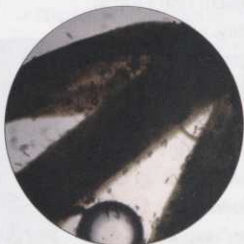
33 Diseases affecting golf courses