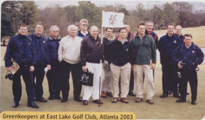
Greenkeepers at East Lake Golf Club, Atlanta 2003