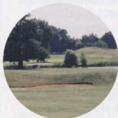
12 Course Feature - Hanbury Manor