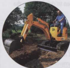
26 Machinery available to tackle construction jobs