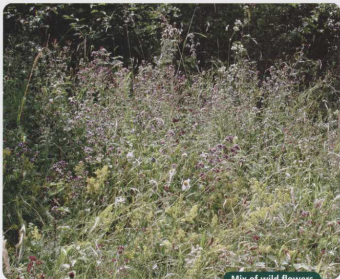
Mix of wild flowers