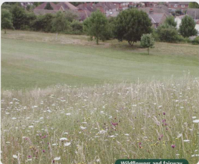
Wildflowers and fairway