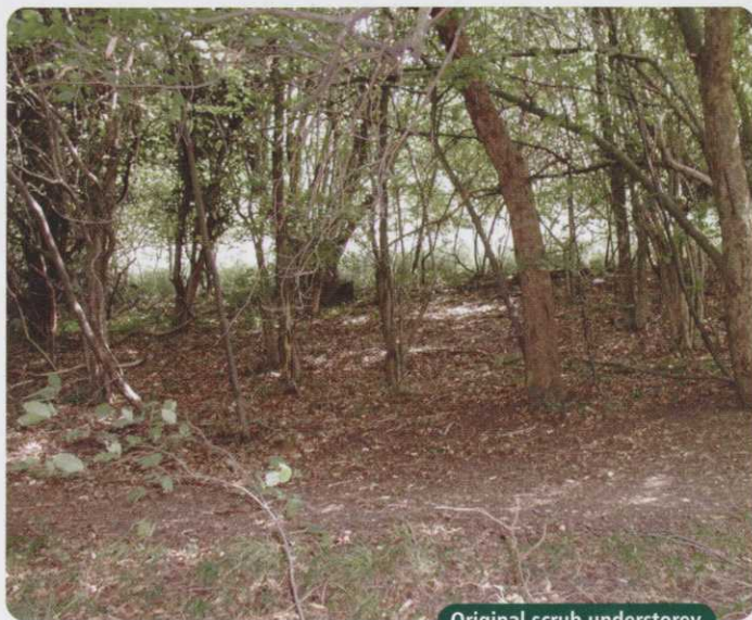
Original scrub understorey

"It is important to remember that good golf is easier to play off finer turf. Consequently there is a natural conflict between trees casting shade and the development of quality playing surfaces."