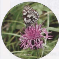
30 The role of trees on the golf course