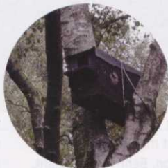
18 The BIGGA Golf Environment Competition 2003