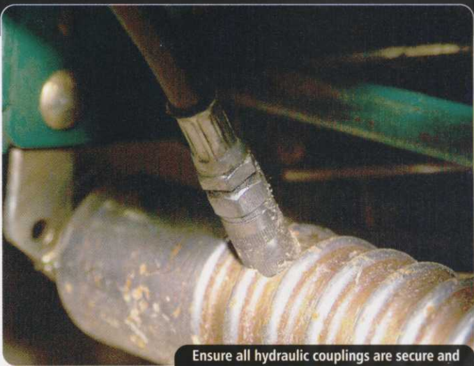
be on the lookout for signs of chaffing on hoses