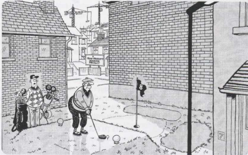
'This used to be the long par 5'