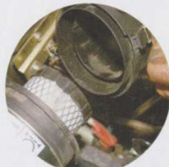
28 Machinery Servicing