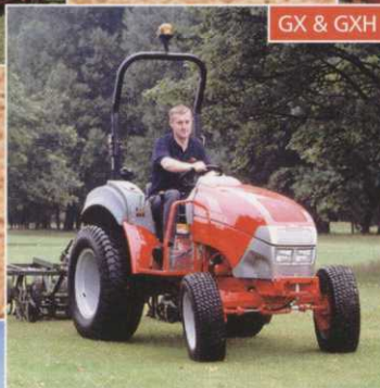
GX & GXH