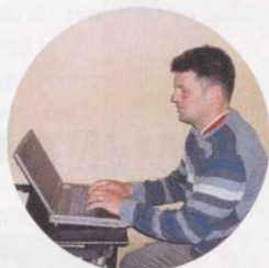
30 Progress made towards an HNC...