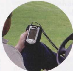
24 The way forward in terms of irrigation