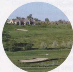
12 Course Feature - Cumberwell Park