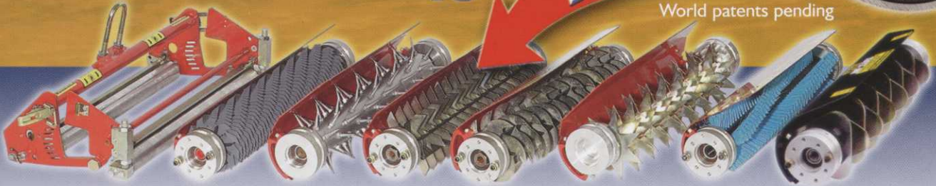
Verticutter Sarel Roller Groomer Scarifier Star Slitter Rotary Brush Deep Slicer