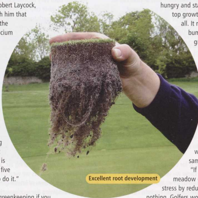
Excellent root development

"If greens were predominately annual meadow grass and you put them under severe stress by reducing the nitrogen you'd be left with nothing. Golfers wouldn't tolerate it so I can understand other