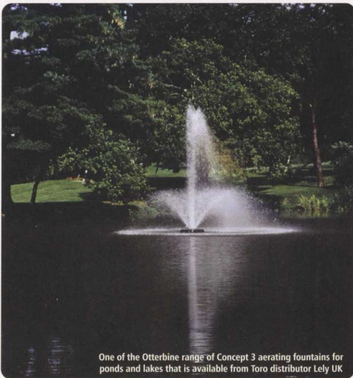
One of the Otterbine range of Concept 3 aerating fountains for ponds and lakes that is available from Toro distributor Lely UK

Ignore water management – whether for irrigation or lakes and ponds – at your peril.