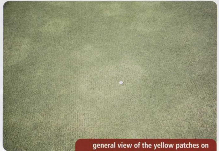
general view of the yellow patches on a creeping bentgrass sward

In 2001, I collected some turf samples from an affected course in the UK. The Course Manager offered a little more information on the problem