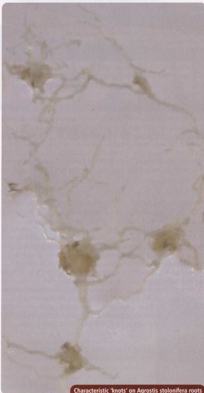
Characteristic 'knots' on Agrostis stolonifera roots caused by the Meloidogyne sp. nematode