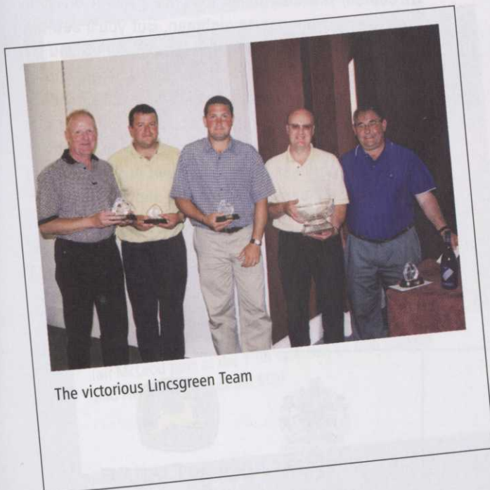
The victorious Lincsgreen Team