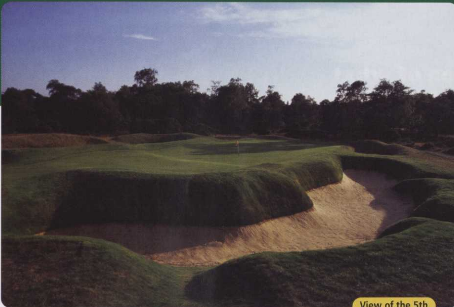
View of the 5th

When the EGU bought Woodhall Spa seven years ago it was felt that a second golf course was required and Donald Steel was commissioned to design the Bracken Course and it has turned into another fine test.