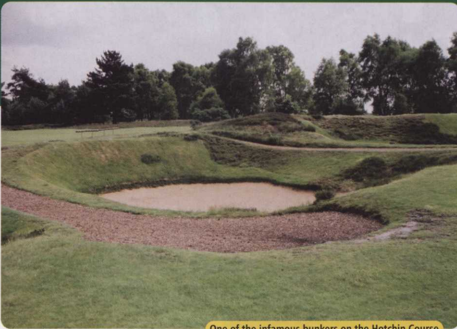
One of the infamous bunkers on the Hotchin Course

Another interesting element of the course is the fact that it is very natural and doesn't lend itself to over presentation.