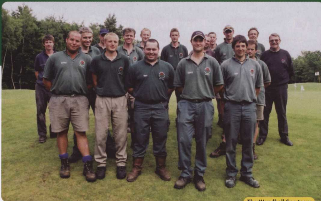
The Woodhall Spa team

We solid spike on a monthly basis throughout the summer as well as using the sorrel fitment on the Toro Sandpro as frequently as possible. We apply minimal nitrogen and potassium to the greens, something along the lines of 60-70 kilos per hectare every year on the greens and tees and we've got some good grasses. I'm also a great believer in Farmura and seaweed liquids and these we apply on a monthly basis."