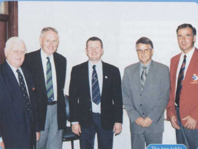
The top table