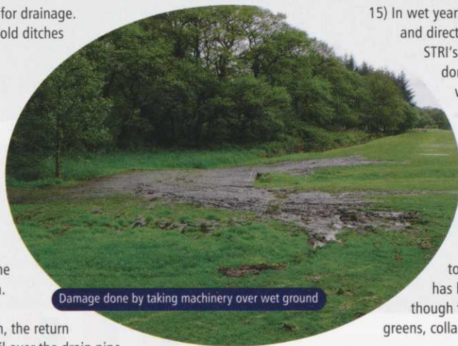
Damage done by taking machinery over wet ground

What do you do in such a situation? Ignore the growth because you know the damage you will do taking machinery onto the course, or mow on regardless? In either case, you are damned if you do, damned if you don't. It is all well and good saying wait until conditions improve so you can safely take machines out onto the course. If you said that in May, you would still be saying it at the end of July this year! Improving drainage and surface firmness through some of the ideas above would be our advice for the medium to long-term but those facing this situation might also consider using growth regulators to slow down growth, thus reducing the need for mowing.