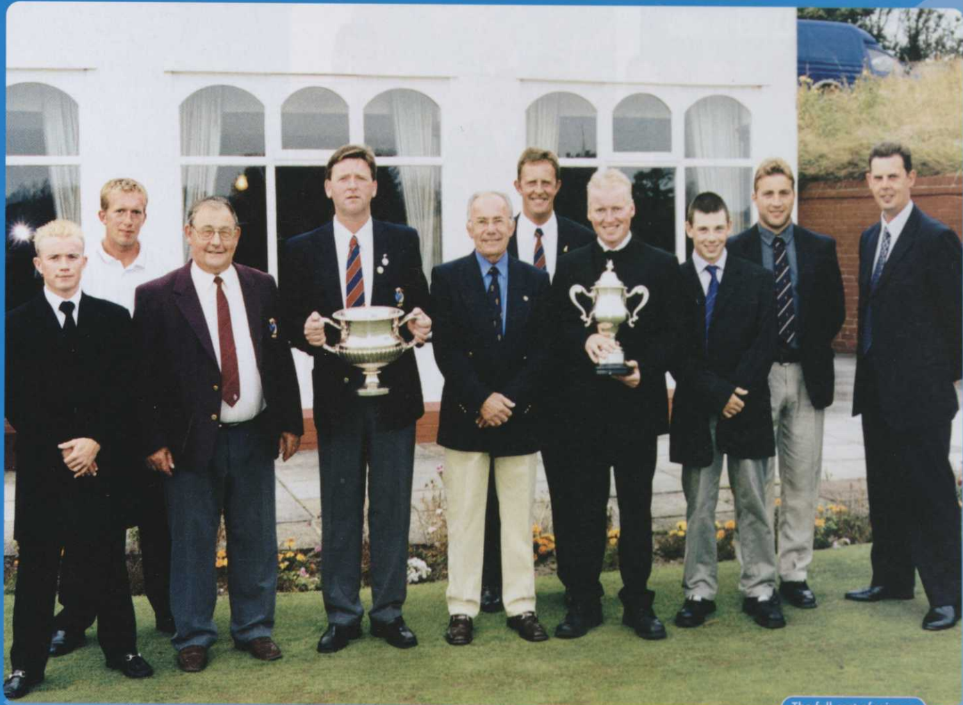
The full cast of winners