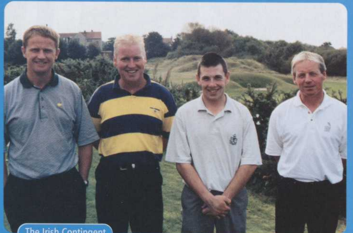
The Irish Contingent