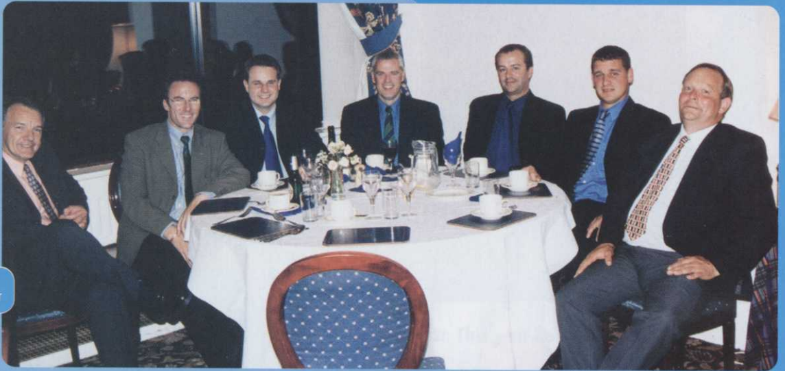
Some of the Championship Sponsors enjoying the dinner