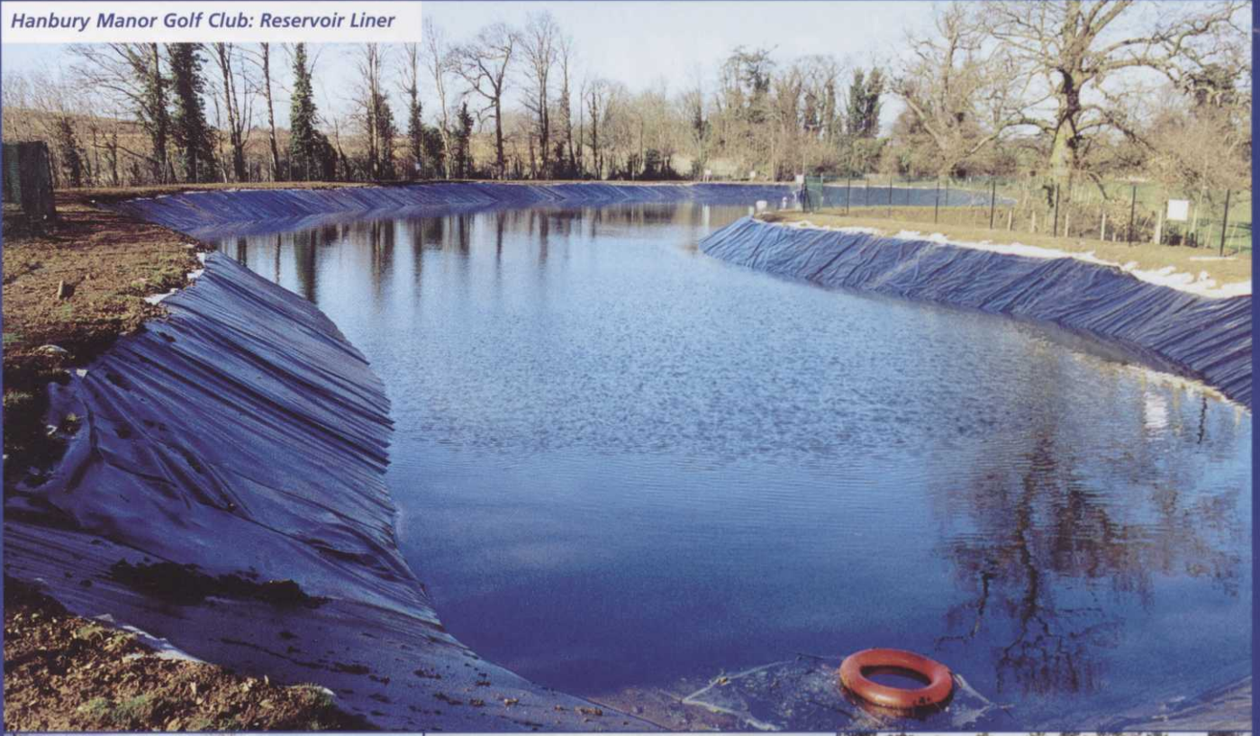
Hanbury Manor Golf Club: Reservoir Liner