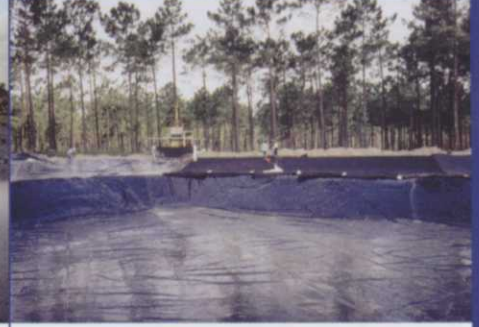
Donnington Grove Golf Club: Pond Liner