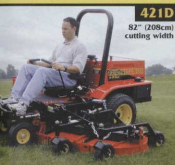
421D 82" (208cm) cutting width

The 421D represents a completely new price-point for an articulating, zero-turning radius, wide-area mower.