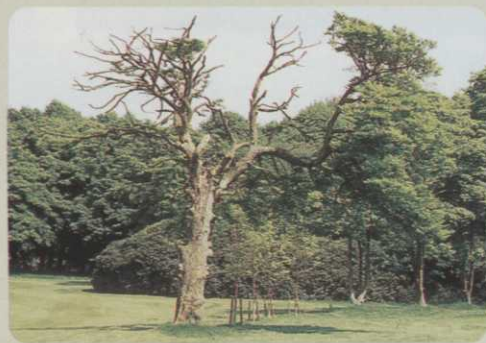
Above: In larger woodlands timber production provides some income