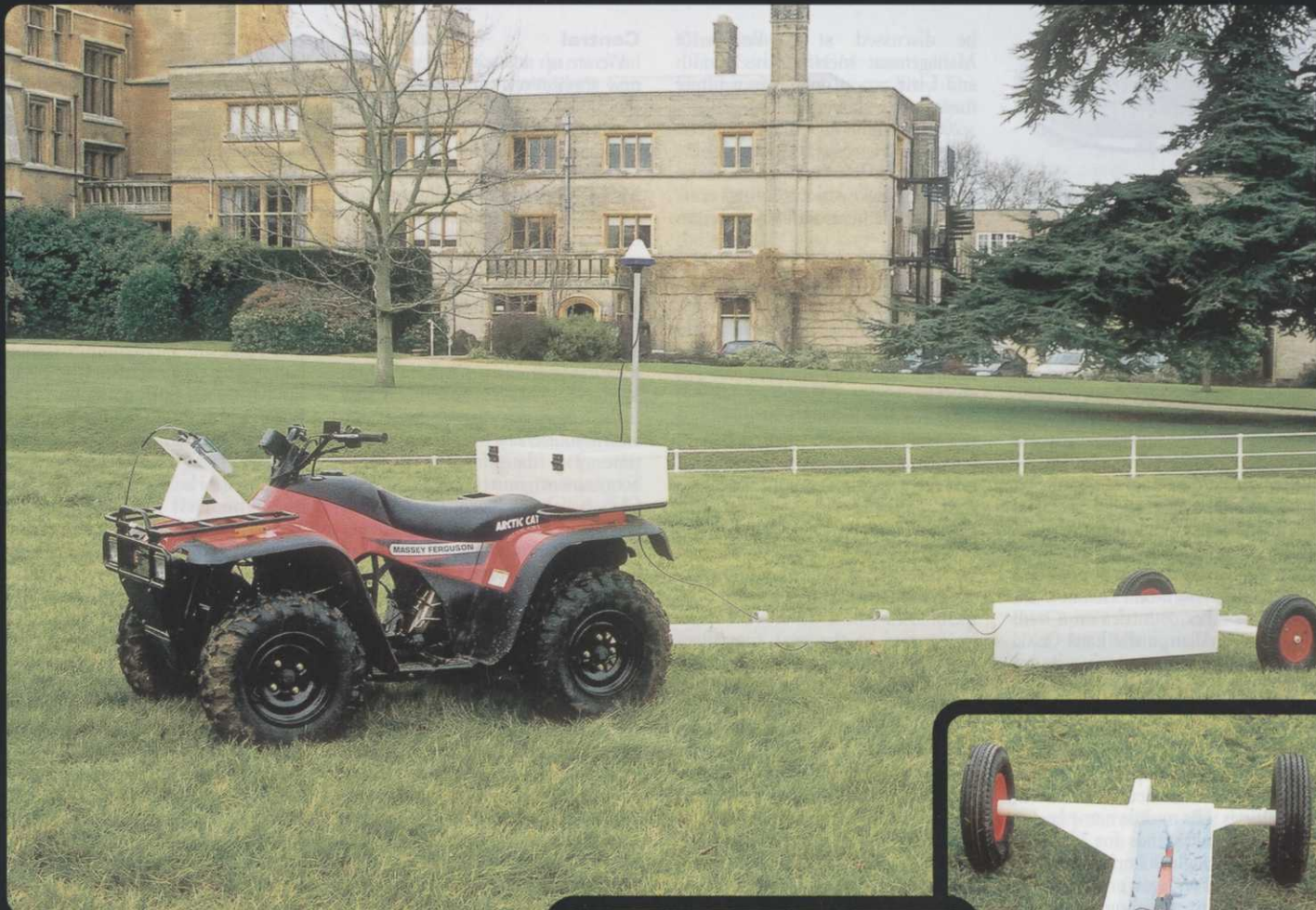
The surveys can be done by hand held equipment or, as above, with a quad bike trailing the sensors

to appreciate. Imagine attending a Green Committee armed with information which highlights why the 8th has always suffered from waterlogging.