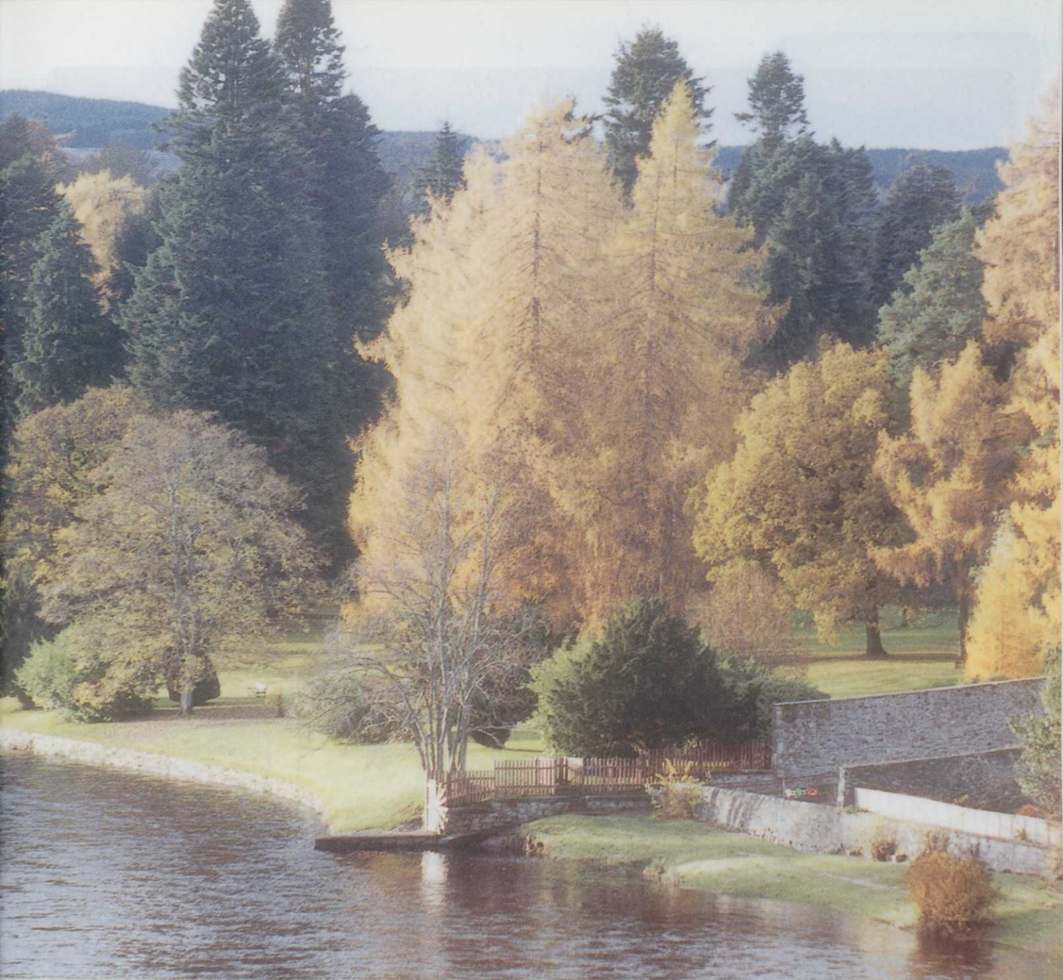
Above: The beauty of trees especially in the autumn