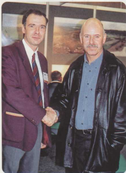
Above. Leicestershire County Second Team Captain meets the 1999 European Ryder Cup Team Captain, Mark James