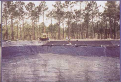
Aroeira Golf Club, Portugal: Lake Liner