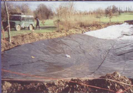
Donnington Grove Golf Club: Pond Liner