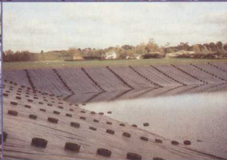
Frilford Golf Club: Irrigation Reservoir Liner