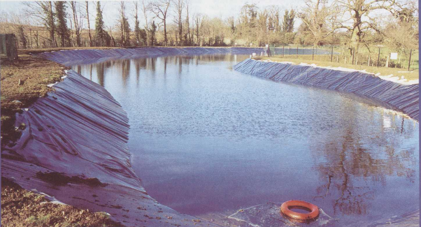
Hanbury Manor Golf Club: Reservoir Liner