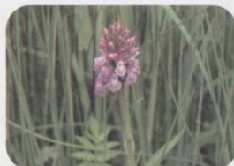
18 Wild Things