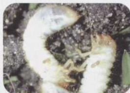
16 Chafer Grubs

© 2001 British and International Golf Greenkeepers Association