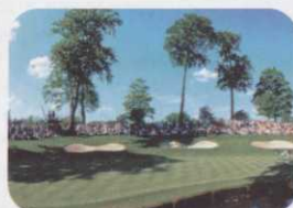
30 Up for the Cup

Daniel Binns leads you through the confusing path of soil analysis