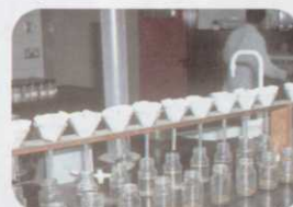
34 Soil Analysis