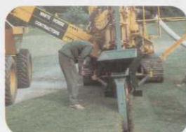
20 Drain Power