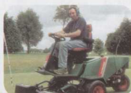
24 Maximum Impact