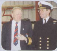
25 Southwick Park