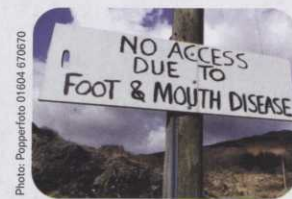
14 Foot and Mouth Disease