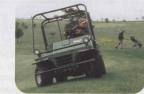
19 All Terrain Vehicles