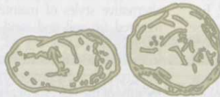
34 True Grit: Sand research