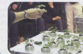
38 Gene Genie