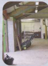
28 Copt Heath