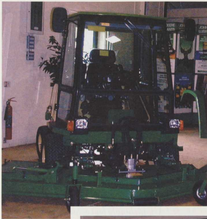
Above: John Deere's brand new headquarters allow plenty of room to display their equipment Right: One of the custom built training facilities at the Langar Headquarters

here, coupled with the ability of John Deere to increase its market share," he explained.