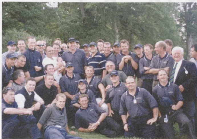
Above: The 2001 Volvo PGA Championship Support Team relaxes with Nick Faldo