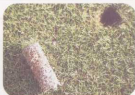
22 Grasses for Greens