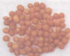
29 Fertility Rights (not wrongs)