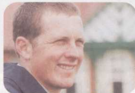
12 A new man at the Helm