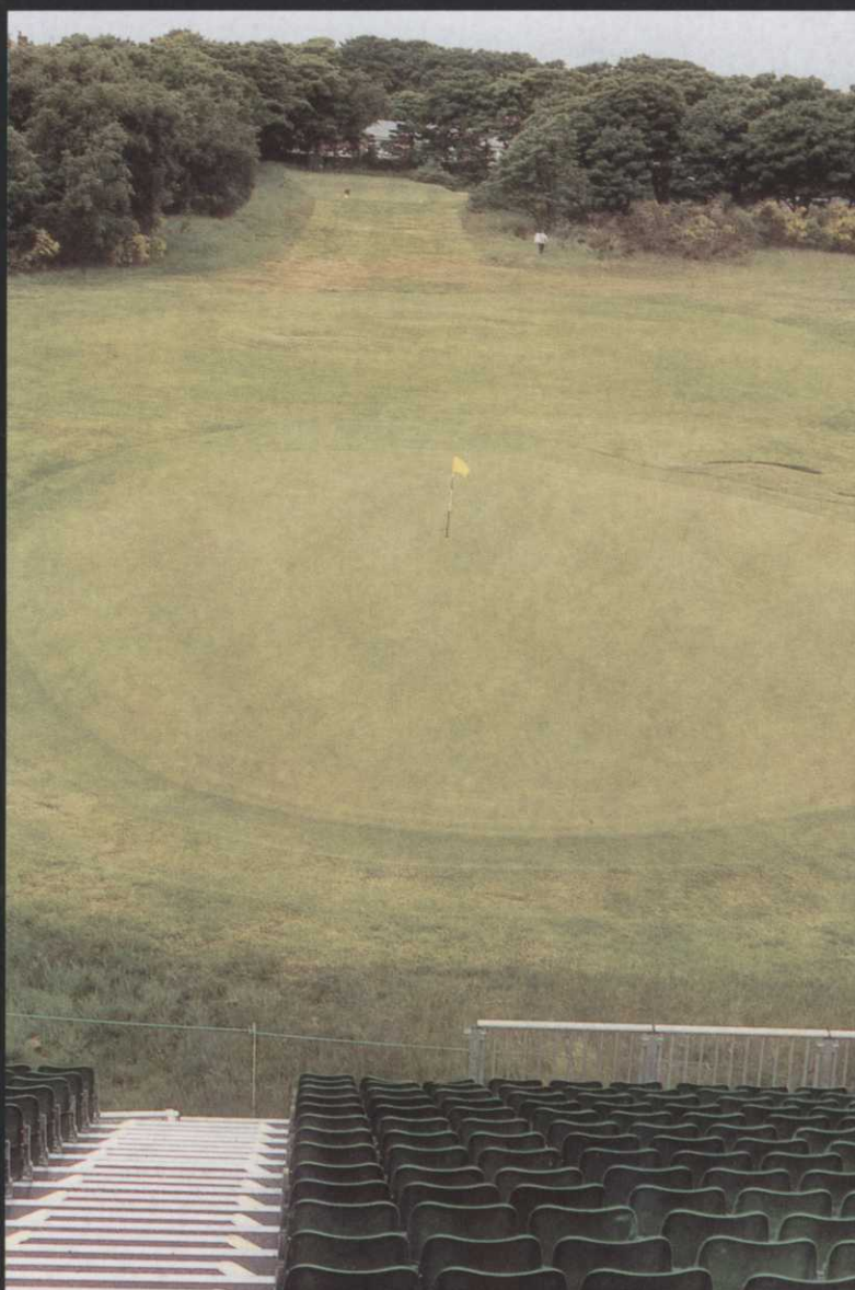
Above: Spectators won't miss a putt, thanks to the high vantage point the seating affords