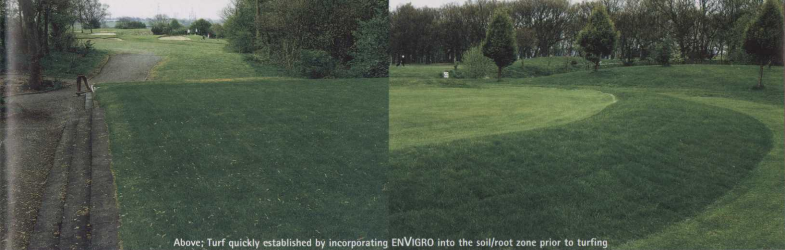
Above: Turf quickly established by incorporating ENVIGRO into the soil/root zone prior to turfing