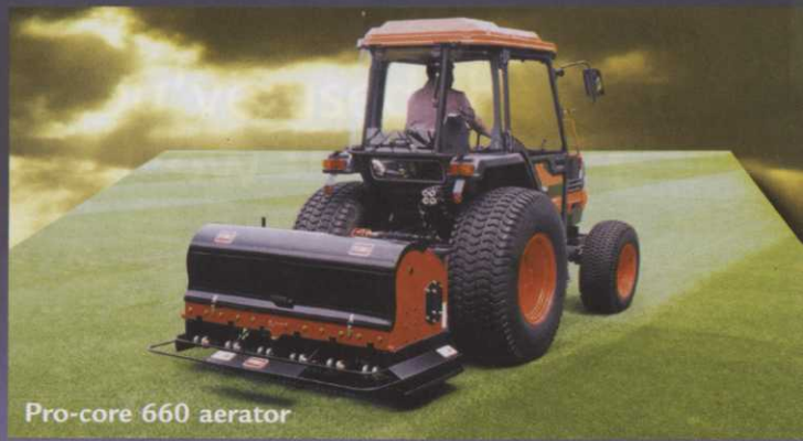
Pro-core 660 aerator