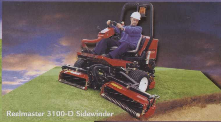
Reelmaster 3100-D Sidewinder