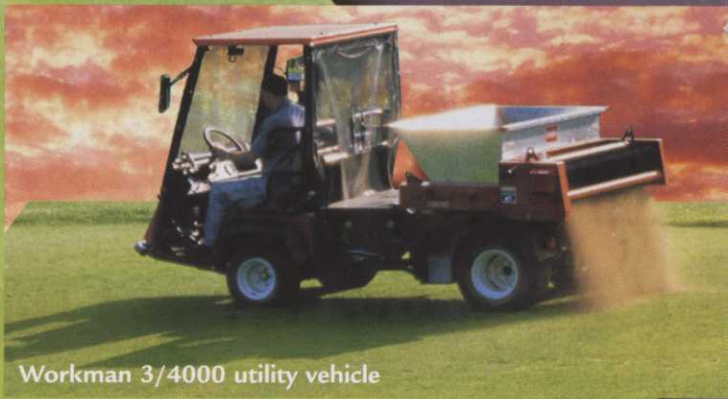
Workman 3/4000 utility vehicle