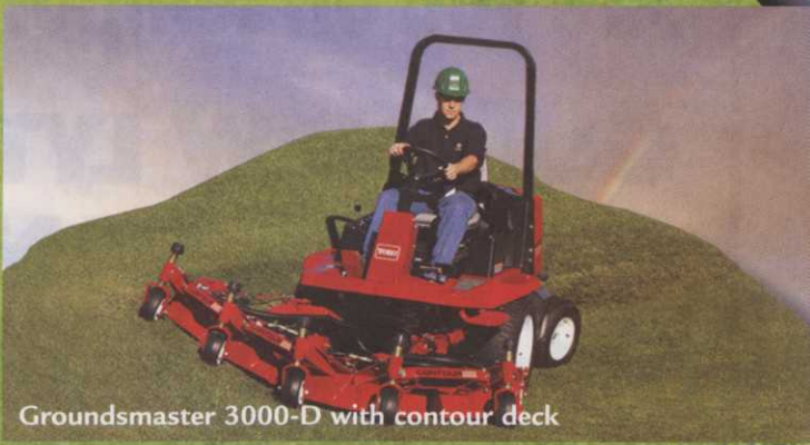
Groundsmaster 3000-D with contour deck