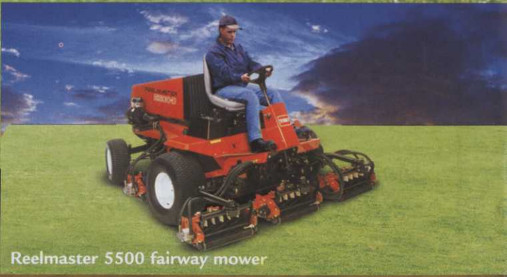
Reelmaster 5500 fairway mower