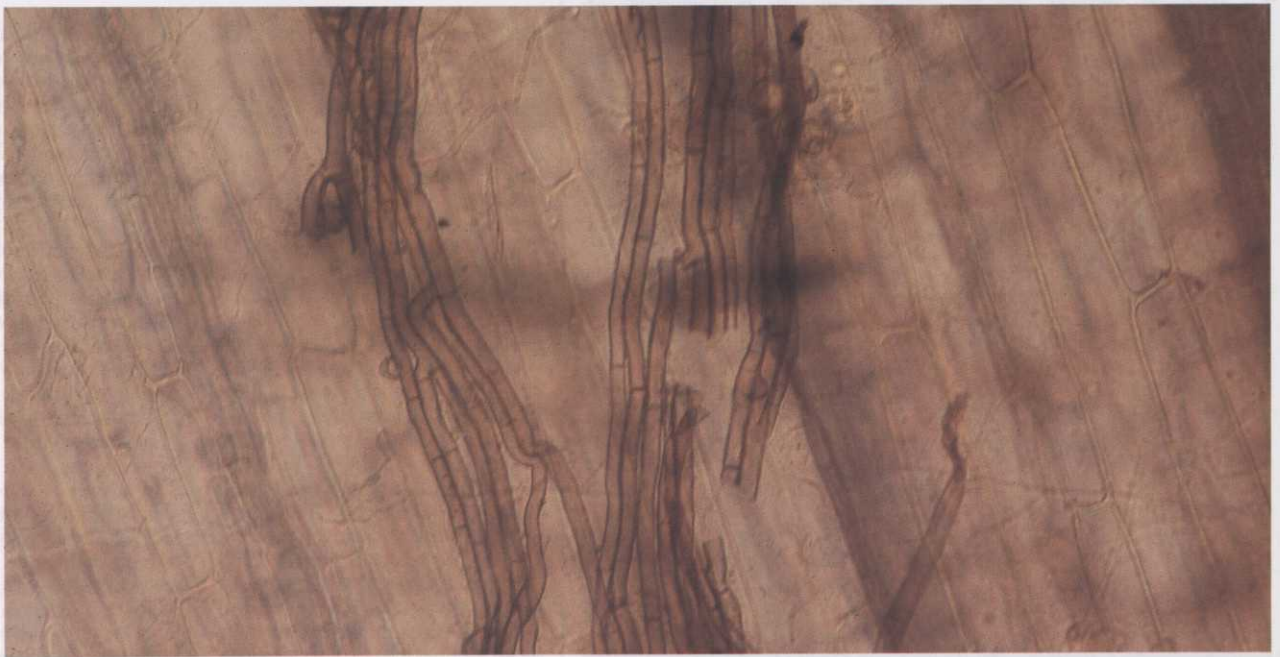
Above: Darkly pigmented fungal hyphae on affected plant tissues

It's probably fair to say that during any one year, the majority of turf samples that I receive for disease analysis, are identified as having a disease problem which you would not be too surprised to see at that time of the year. This is because, generally speaking, diseases are seasonal, the reason for this is that the overriding factor that affects disease development, is the prevailing environmental conditions.