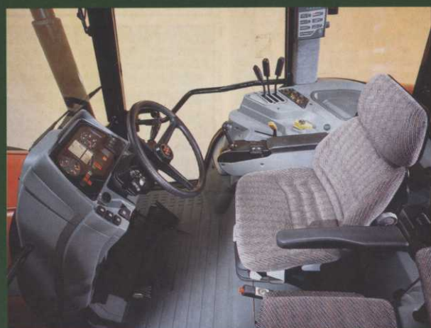
Above: Cab interiors have functional switchgear and familiar control layout

"The name is one that most people would know anywhere in the country and if they buy a Massey Ferguson product they know they will only have to travel a few miles in either direction to find a dealer. The products are well engineered, well developed and have a good support package in terms of parts.