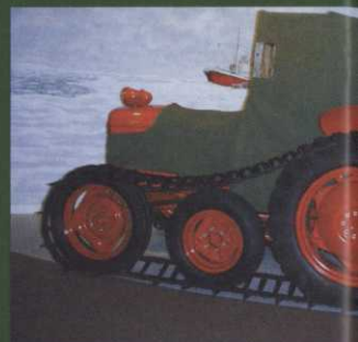
Above: Edmund Hillary used this very tractor on one of his expeditions to the South Pole. It now has pride of place in the Massey Ferguson museum at Coventry