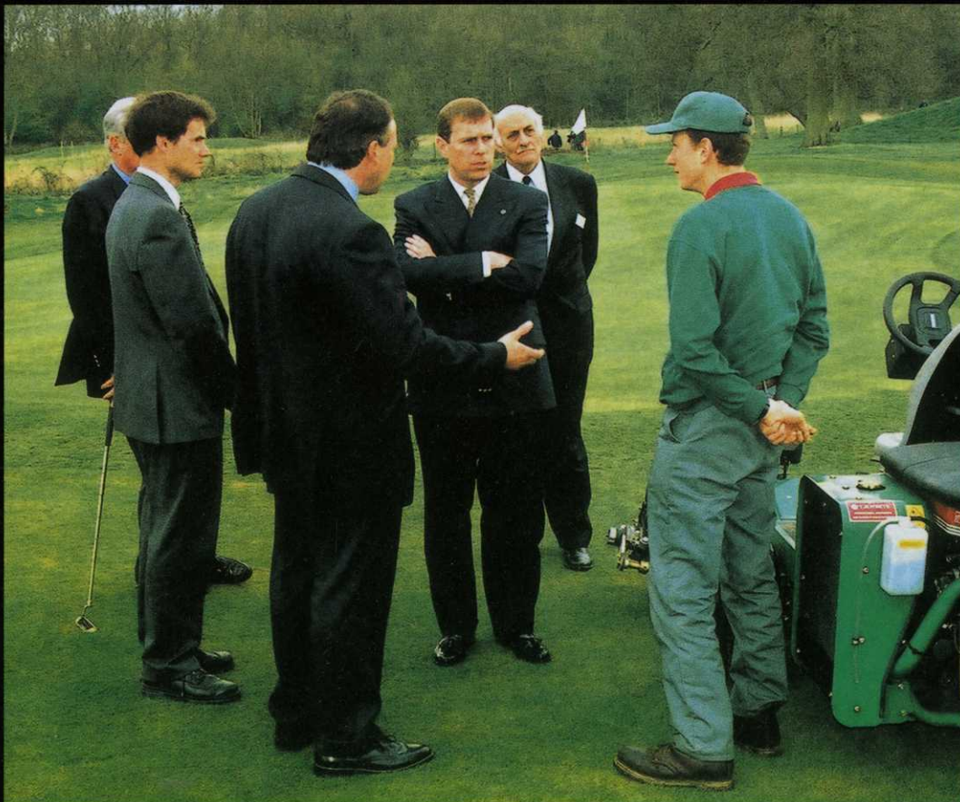
Below: The Duke of York shows interest in the project at the official opening

"We saw it as an opportunity to use some of the more unusual, future looking, cultivars that we've been