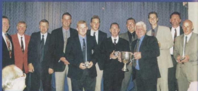
Below: The victorious South East team