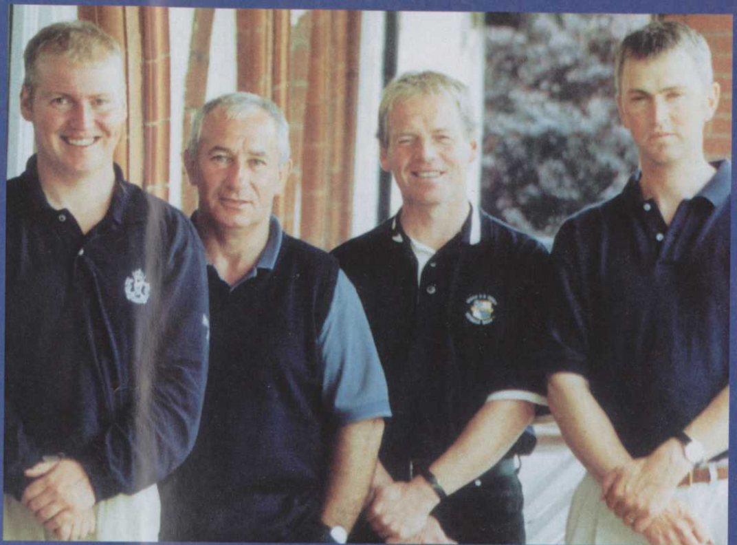
Above: The four Northern Ireland representatives made a huge impact on proceedings over the two days