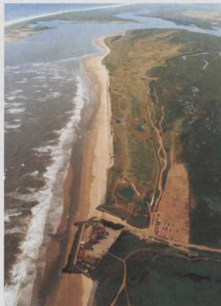
33 On Course for Change This month's cover features a stunning aerial photograph illustrating the scale of coastal erosion at Brancaster GC