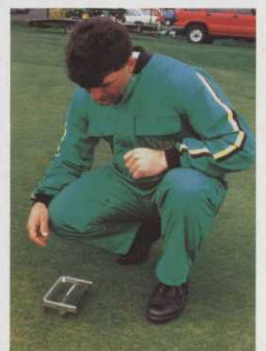
67 A Close Shave