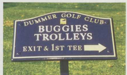
50 Finishing Touches