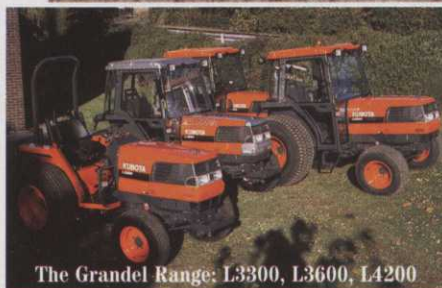
The Grandel Range: L3300, L3600, L4200