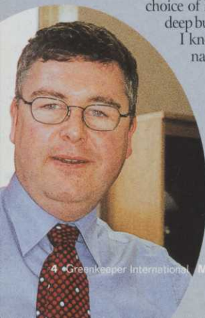
Editor: Scott MacCallum

Golf is an easy target and if it is a choice of holding greens or a hot, deep bubble bath I'm pretty sure I know what would win the nation's vote.