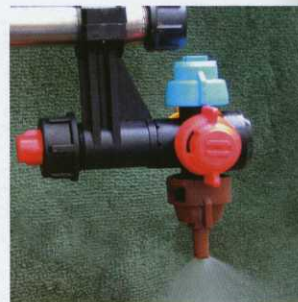
40 Spray Away