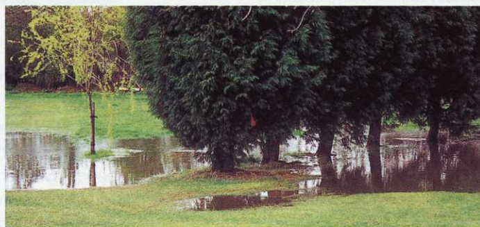
Humberston Park's flooding