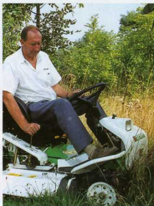
24 Grass Attack

A look at the environmental management work undertaken at Fairways Golf Club, near Clacton on Sea