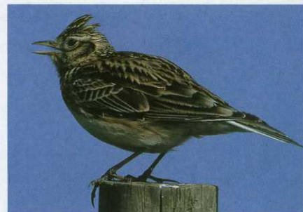
48 Managing an environment