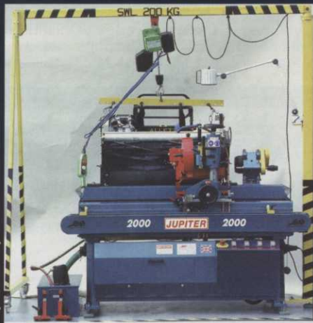
Jupiter 42" Cylinder and bedknife Grinder